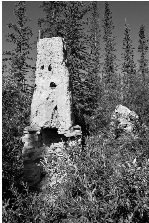
Figure 4 Remains of Fort Confidence chimneys in 2011. A. Bunker, “Bunk’s Outdoor Angle,” Aug. 16, 2011. https://bunksoutdoorangle.com/awarded-the-arctic/