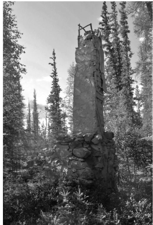
Figure 6 Remains of one of four chimneys at Fort Reliance in 2021. Notice the wooden lattice framing the chimney.