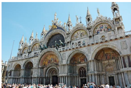
Figure 4 Venice, Basilica of San Marco, west façade, thirteenth to fourteenth centuries.

foreign objects on the church's three façades. The west façade features the greatest ornamentation, consisting of an array of columns and capitals combined with Byzantine reliefs, while the crowning artwork is the set of bronze horses taken from the Hippodrome in Constantinople (figure 5) (Jacoff 1993; Favaretto 2003, 188-91; Galliazzo 1984). The eclectic spoliata assemblage on San Marco, like that on San Sisto in Pisa, defined a distinctive aesthetic that combined plunder of war with objects acquired in Mediterranean markets to express Venice's new civic identity and imperial aspirations.