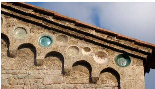
Figure 3 San Sisto, detail of bacini decoration on west façade.

paign conducted by the Pisans and Genoese against the North African cities of al-Mahdiya and Zawila (Berti 1993, 127-28; Garzella 1991, 189). The church was built to celebrate this victorious expedition and was funded with the proceeds from the military campaign (Cowdrey 1977, 18; Scalia 2007, 813-14). San Sisto originally had 129 eleventh-century bacini ornamenting its stone exterior (figure 3). The fifty-two remaining ceramics on San Sisto's facade and side walls, all placed above blind arches immediately below the roofline, consist of products from North Africa, Sicily, Egypt, and Spain (Berti 1997, 25; Berti and Tongiorgi 1981, 49-61). The bacini might have been chosen as appropriate decoration for Pisan churches because of their connection to Mediterranean commerce, a significant source of wealth for Pisa in the eleventh to fourteenth century (Mathews 2014, 16-19). The Pisan fleet battled valiantly to secure safe passage for the city's commercial vessels and the bacini could index this great struggle for maritime supremacy and the material fruits of those labors, with international trade goods such as the foreign and exotic ceramics so proudly displayed on the city's churches.