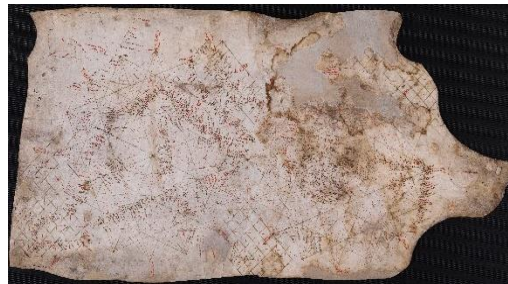
Figure 1 The Carte pisane , late thirteenth century.

extend rhumb lines across the vellum surface. Intended to be used with a magnetic compass, the lines represent compass directions to assist in navigation. This nautical or portolan chart represented the most current data for nautical cartography available at the time, a veritable compendium of navigational knowledge that would have accompanied mariners aboard their ships as they traversed the Mediterranean (Campbell 1987, 371, 377; Hoffman 2013, 30). By the fourteenth century, then, visual formats gained popularity for the presentation of cartographic data with increasingly sophisticated maps presented in large-format charts and atlases.