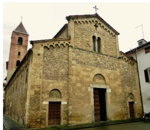
Figure 2 Pisa, Church of San Sisto, west facade, 1087.

potential to be understood as war spoils and commercial goods, made them potent carriers of meaning for merchant patrons and audiences. One of the earliest manifestations of a merchant visual style in the Italian maritime republics is the highly original spolia decoration found in Pisa. Beginning in the eleventh century, Pisan churches featured architectural decoration consisting of ceramic basins ( bacini ) imported from the Islamic world (Berti 1991; Berti and Giorgio 2011; Berti and Tongiorgi 1981). At this time, western Europe lacked the technical knowledge to produce glazed ceramics, making their provenance clear; these colorful glazed vessels were made in Islamic pottery centers and then exported across the Mediterranean. Among the early Pisan structures with bacini decoration, the church of San Sisto stands out with its vast number of objects and ceramic types from several production centers (figure 2).