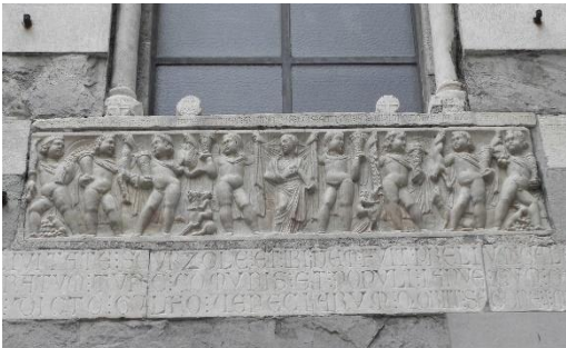
Figure 7 San Matteo, detail of ancient sarcophagus on the west façade.

The texts on either side of the entrance portal and around the sarcophagus record military victories won by various members of the Doria family and refer to the plunder taken in those battles that came to be housed in the church of San Matteo. The battles recorded here, however, were not fought against foreign adversaries but rather against Italian commercial rivals and the spoils of war collected in San Matteo came exclusively from Pisa and Venice. The Genoese took the sarcophagus from the Venetian-controlled island of Curzola and used it as the burial place for the great general Lamba Doria (Silva