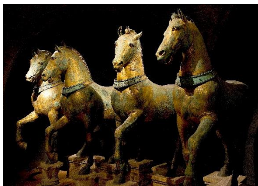
Figure 5 San Marco, original bronze horses from west façade (Museo di San Marco).

The church of San Matteo in Genoa, like the Basilica of San Marco, served as a civic religious space and private chapel simultaneously (figure 6). The structure was built by the Doria family, whose members served in the city government, led the Genoese navy, and actively participated in Mediterranean commerce. Their church enjoyed a central location in the city and competed with the cathedral as a potent symbol of Genoese civic identity. The thirteenth-century façade of the Doria family church displays the standard black and white stripes of Genoa's medieval structures and, similar to numerous other churches in the city, is adorned with an array of ancient Roman spolia (Müller 2002, 107-64; Toncini Cabella 2001, 21-27; Müller 2003). On the right side of the façade, immediately below a small window, is an ancient sarcophagus (figure 7) (Dufour Bozzo 1967, 23, 45-47; Faedo 1984, 142; Conti 1990, 300, 318-19; Müller 2002, 116-22, 226-29). Two other Roman artworks rest on consoles on either side of the rose window. A bust length figure, now missing its head, is placed on the left and a nude torso is located on the right. Complementing the Roman objects on display were inscriptions incised into the façade (Müller 2003, 15; Müller 2002, 126-33).