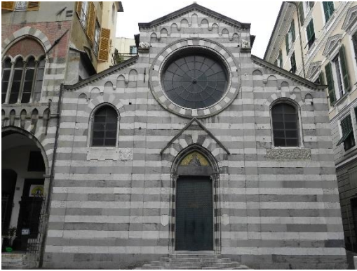
Figure 6 Genoa, Church of San Matteo, west façade, thirteenth century.