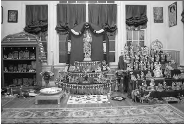
Fig. 18 A sunroom converted into a worship room with the permanent home shrine on the left and the temporary kolu shrine in the center and right of the room.