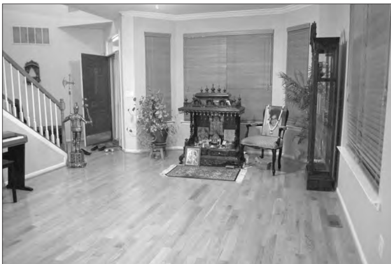
Fig. 11 A formal living room converted into a worship room with a shrine near the entrance of a single-family home in central New Jersey.

Although I often found kolu shrines set up in finished basements, Gayatri’s formal dining room festival setup works out much better. Basement shrines, as some informants explained, split the festival throughout the house. Women walk down to see the shrine, and then walk up to eat. Formal dining rooms converted into festival rooms pack the festival into one room. It enables easy access to the kitchen, where food is cooked and served to women seated in the kolu room, without the need to walk up and down any staircase either for the host or guests.