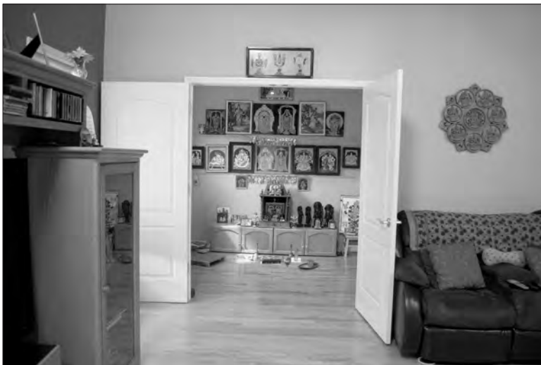
Fig. 19 A custom-made worship room constructed next to the family room.

size to accommodate spatial needs of gods and not humans. Since humans are mobile, they need larger rooms, but that is not the case with gods who due to human devotion and religious desires are permanently stapit (seated) in the house. To give deities a room meant for human living appears disrespectful to divine needs.