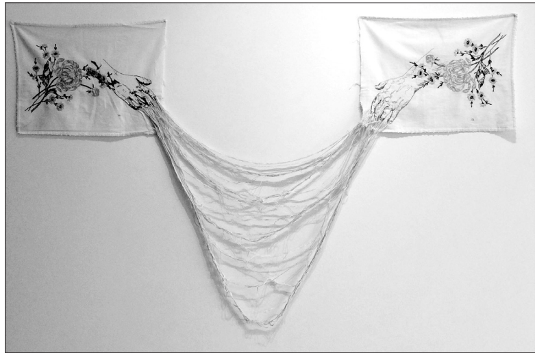
Fig. 5 Joetta Maue. 2012. Touching. Hand embroidery on re-appropriated linen. Credit: Joetta Maue.

Maue’s piece, Touching , features two handkerchiefs connected by frayed threads emerging from finely stitched hands, their fingers