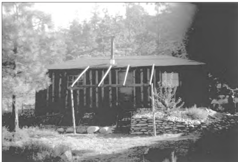
Fig. 1 "1943 May. Matsui House clad with tar paper to be wind proof. The only house with a basement." 2