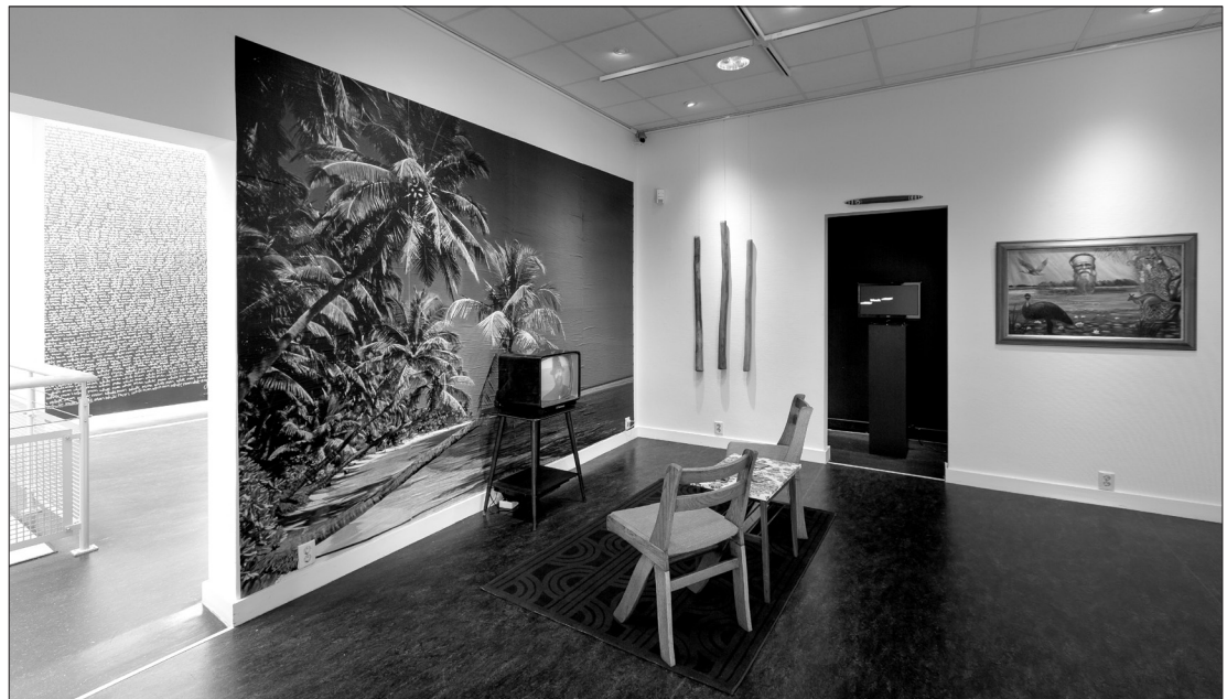
Fig. 7 Blak Douglas and Adam Geczy, Bad Interview , colour video, 2013 and White cunt black cunt , video animation, 2013.

The photograph of a naked Aboriginal woman, lying on a rocky beach with her legs curled suggestively around a bollard painted with the Australian flag, takes up the historical