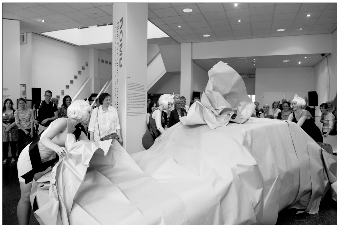
Fig. 8 Official opening exhibition BOMB.

Then there is CLUB : coloured golf balls spelling out the four letters on a carpet of artificial grass. Golf courses occupy Aboriginal land dispossessed through colonization and used by one of the most exclusive groups of people. The pedagogical tone of the exhibition text is similar to that used in Silver Bullet : Aboriginal claims to sovereignty and resistance, symbolized by the colours of the golf balls—those of the Aboriginal flag—are weakened by internal divisions. The polyvalent word play in the title of CLUB , which evokes Aboriginal clubs as well as golf clubs, flawlessly conjures up a key site of contestation in this concatenation. If the seedy artificial grass repels the eye where an engraved