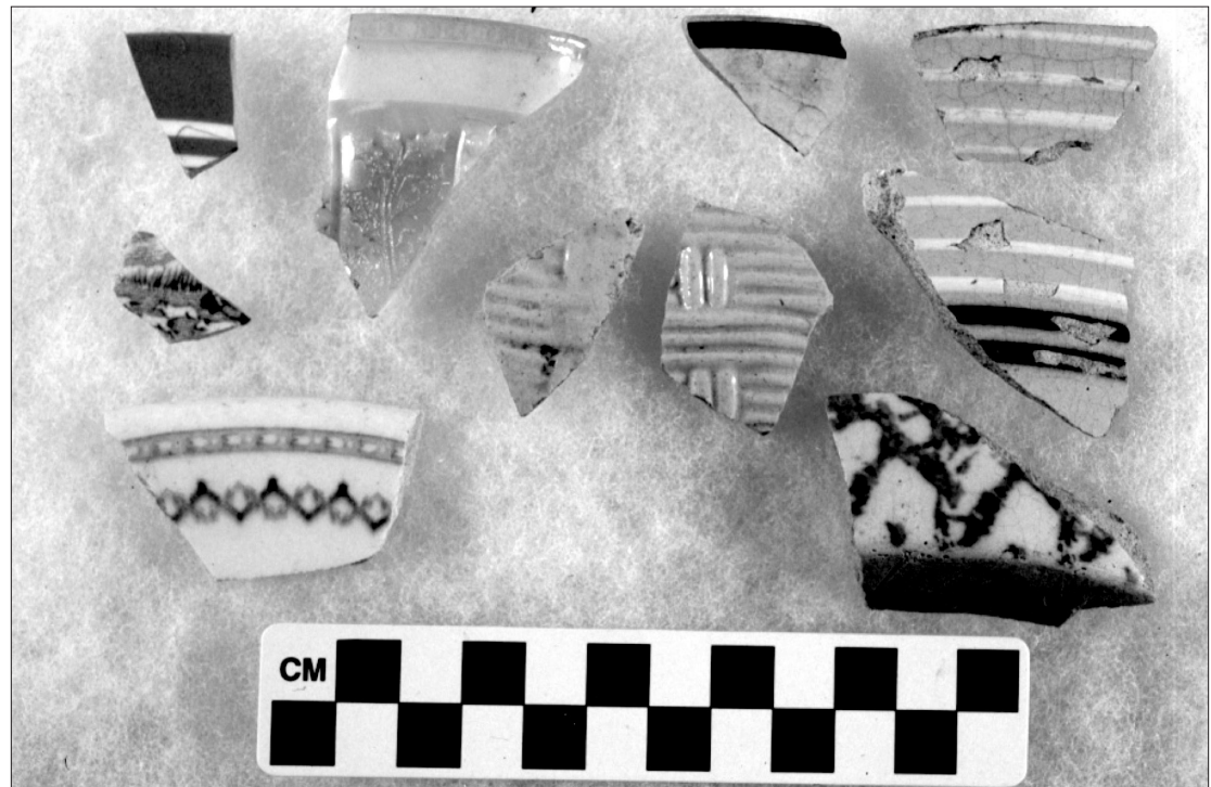
Fig. 4 Sampling of ceramics and glass collected in 2006–2008 excavations.