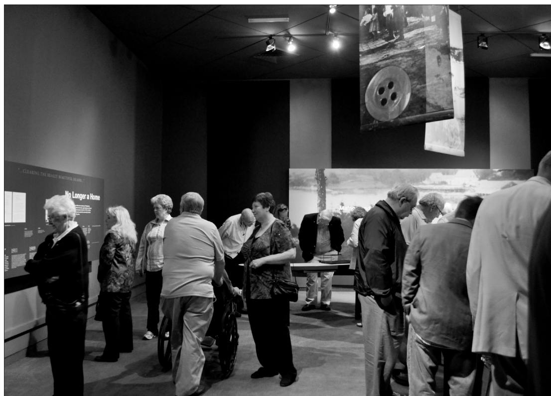
Fig. 5 Photograph of opening of Malaga Island: Fragmented Lives exhibit opening on May 19, 2012.

The most mundane artifacts can provide evidence for historical events that occurred on the island. More than 27,000 pieces of metal were excavated, the majority of which are nails and other types of construction materials that were deposited during the deconstruction of the island’s structures, 1911-1912 (Hamilton 2013). A small ring made of glass and wire was found spilling from the side of the midden, perhaps a handmade token of love from one of the men to his wife. The cemetery’s location is still unknown, despite testing and mapping to determine its location. The composition of the midden itself provides a vast amount of insight into the ways in which this group of people changed their environment to suit their needs. The north end of the island has very high bedrock, like much of the Maine coast. In order to build a suitable walking surface, the inhabitants had to construct