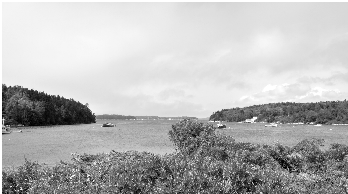
Fig. 3 Facing north while standing on the McKenney locus on Malaga Island. Phippsburg is to the right, while Bear Island is to the left.

One of the largest of the State's degenerate communities, that on Malaga Island, has been ingeniously dispersed by the State's taking over this unorganized and unclaimed island and annexing it to an adjoining town. Three consignments of feeble-minded children were sent to the State School for Feeble-minded [Pineland] and the squatters notified to remove their shacks. In the course of time this was done and little hardship resulted. Before this step was taken, however, dwellers on the nearby main land were often startled at night by the weird shouts, howls, profanity, obscenity, and