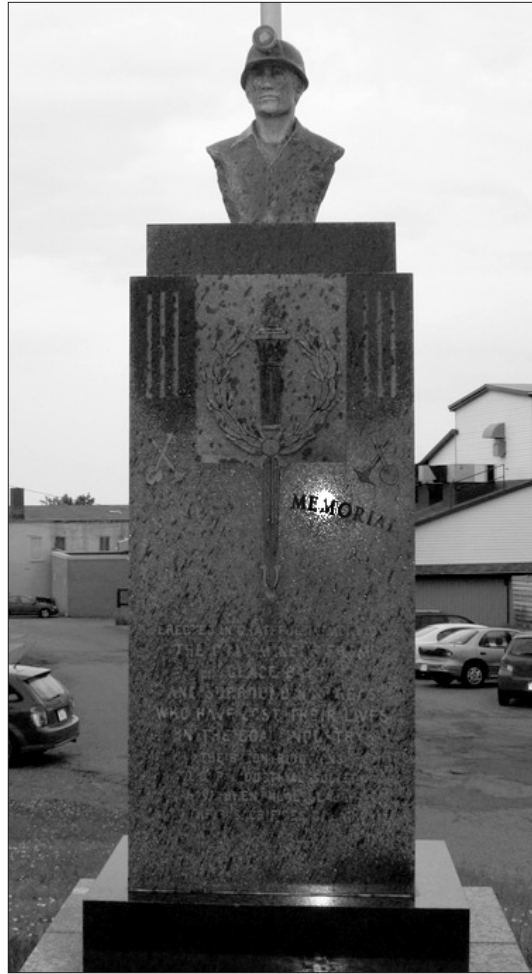
Fig. 4 (right) Miners' Memorial, Glace Bay.

Glace Bay. This was partially in response to the 1960 Royal Commission on Coal and the 1966 Donald Report, both of which questioned the viability of the coal mining industry in Cape Breton and called for economic diversification (Beaton 2010: 44). The miners' museum opened in 1967, and was marketed as a tourist attraction (Beaton 2010: 46). Guided tours of a mine shaft conducted by former coal miners were a major feature in the new museum; these tours implicitly revealed the importance of workers' experiences in the representation of local industry.