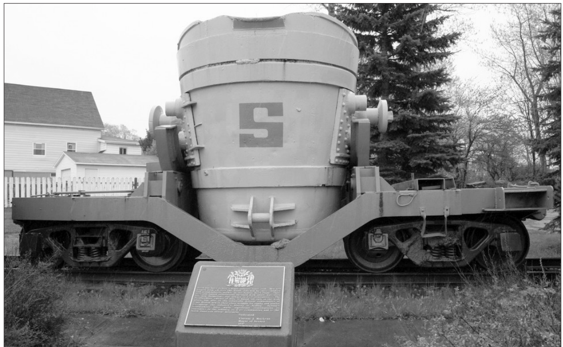
Fig. 10 Steel Ladle Monument, Sydney.

Steel has been Sydney’s major industry since 1899. Men and women from all over the world, followed by their children and grandchildren,