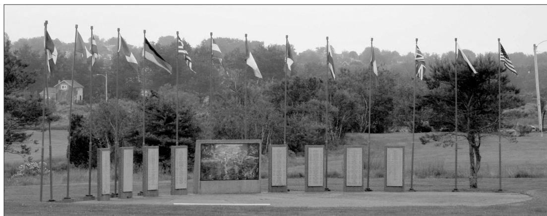
Fig. 5 Miners' Fatality Monument, New Waterford.

At the centre of Colliery Lands Park stands the Miners' Fatality Monument (Fig. 5). This monument is composed of eight grey granite