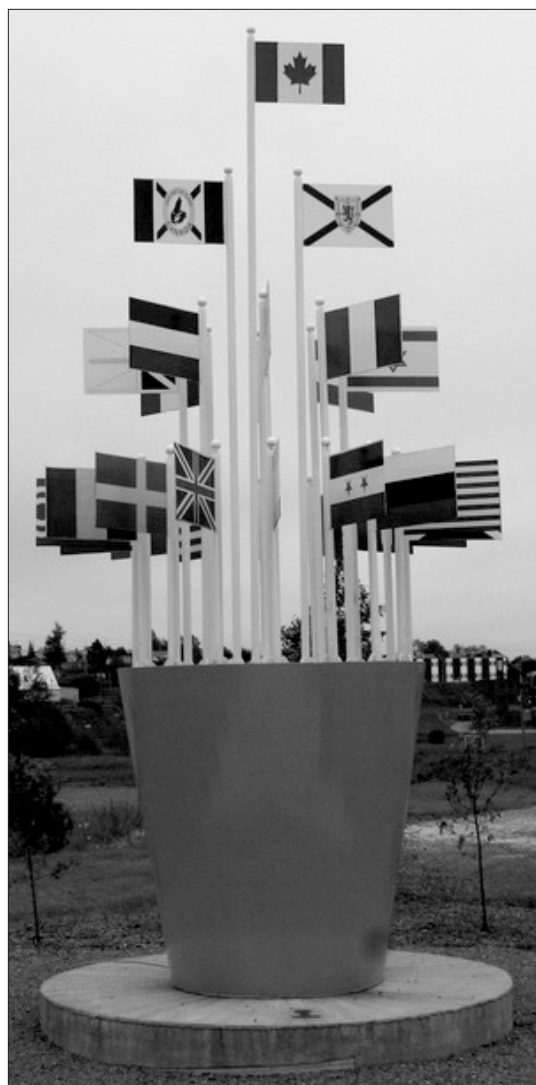
Fig. 13 Melting Pot Monument, Whitney Pier.