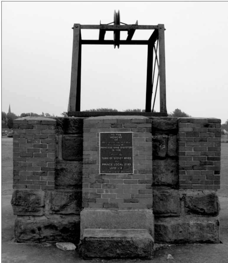
Fig. 7 Princess Colliery Disaster Monument, Sydney Mines.