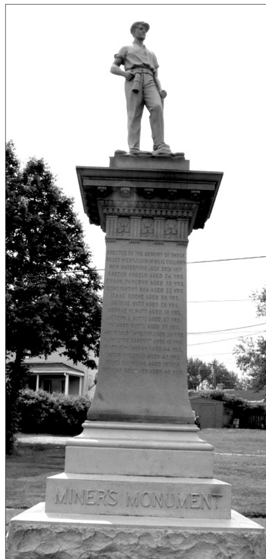
Fig. 1 Miner's Monument, New Waterford.

The earliest markers reflect the importance of the coal industry. The Miner's Monument, erected in 1922 by the UMW in New Waterford, was dedicated to miners who had been killed in that town during a mine explosion in 1917. This monument reflects the importance of the union in the early 20th century, the development of a class-based local identity and the dangers of work in the local collieries (MacKinnon 2013a; Fig. 1). Seven of the twenty-one labour landmarks