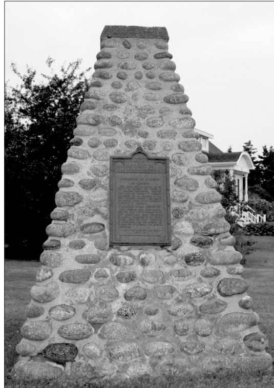
Fig. 2 First Mine Monument, Port Morien.

are found in New Waterford, where workers commemorated their experience much earlier than in any of the other industrial communities.