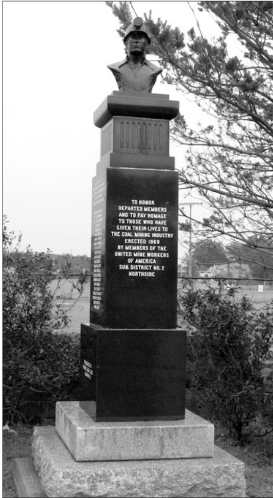
Fig. 3 (left) Miners' Monument, Sydney Mines. (Photo by author).