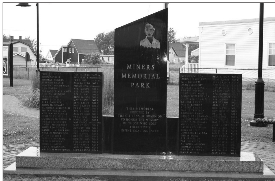
Fig. 6 Miners' Monument, Dominion.

Taken as a whole, the Miners' Fatality Monument represents workers' experiences in New Waterford through the past century. The inscribed names, the flags and the central mural all serve to memorialize both those who have died and those who have spent their lives working underground. Each name represents the life and death of a man employed in local collieries, an insight that is furthered by the images depicted on the central mural. Although the individual life-stories of these men are not available on the face of the monument, they make up a large portion of the community's conceptualization of the industrial past. While the Colliery Lands Park