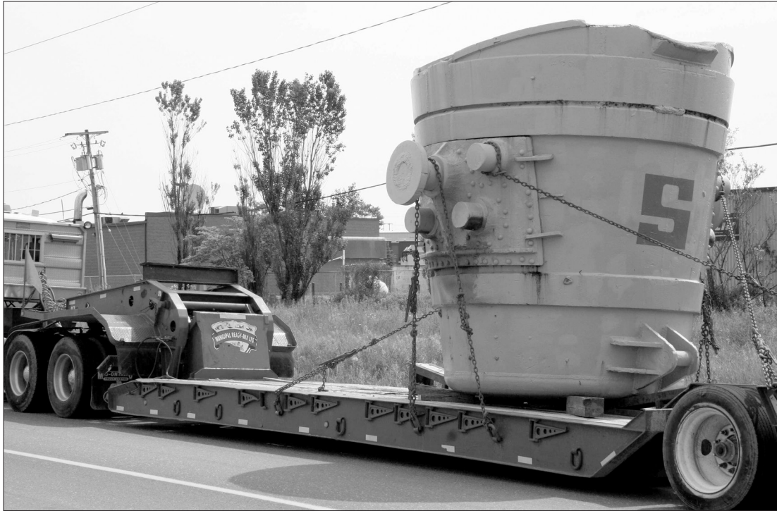
Fig. 11 Moving the Ladle, Sydney.