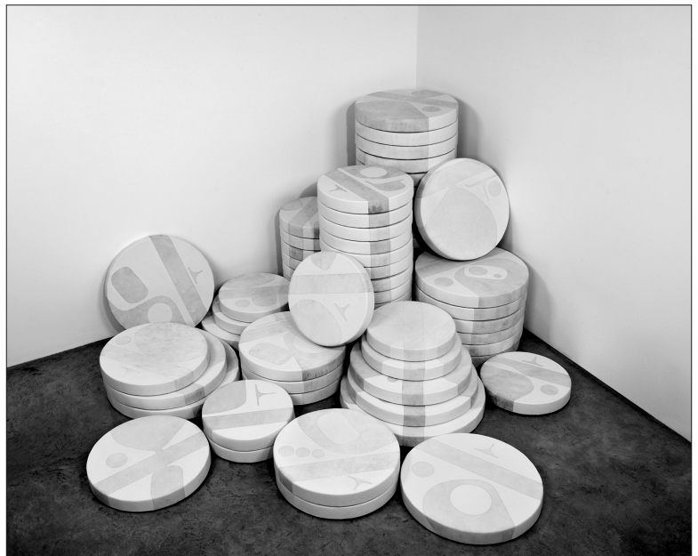
Fig. 5 Sonny Assu. Silenced: The Hidden . 2011. Acrylic on 67 animal hide drums. Installation variable.

Death Blanket (2006) and The Great Appropriator Embrace (2003), he references not only the potlatch ban but also the use of woollen blankets in the making of traditional ceremonial regalia known as the button blanket robes. Button blanket robes have historically been made in indigenous communities along the Pacific Northwest Coast using navy Hudson's Bay Company woollen blankets embellished with mother of pearl and abalone shell buttons that outline clan crests and sacred heraldic images. By bringing this post-contact Western material into indigenous regalia, and then repositioning it as a work of art in the gallery, Assu offers an interpretation of button blanket robes that also references the appropriation of culture and materials and the incidences of cultural death associated with cultural contact. In Death Blanket , for example, Assu replaces a clan crest with buttons that trace out the outline of a skull. Assu notes, "The HBC blankets were also used to spread small pox and tuberculosis amongst the First People to aid in the act of genocide western society would rather forget" (qtd. in Baxley 2011). 13 In these three works alone, Assu has mobilized the woollen blanket as a way to activate history and the complexity of objects within various contexts from his community to the shifting values within artwork in the gallery.