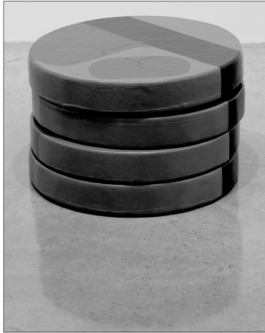
Fig. 4 (Right) Sonny Assu. Silenced #2. 2010. Acrylic on stacked elk hide drums. Four drums overall dimension 11" x 18" x 18."

Death Blanket (2006) and The Great Appropriator Embrace (2003), he references not only the potlatch ban but also the use of woollen blankets in the making of traditional ceremonial regalia known as the button blanket robes. Button blanket robes have historically been made in indigenous communities along the Pacific Northwest Coast using navy Hudson's Bay Company woollen blankets embellished with mother of pearl and abalone shell buttons that outline clan crests and sacred heraldic images. By bringing this post-contact Western material into indigenous regalia, and then repositioning it as a work of art in the gallery, Assu offers an interpretation of button blanket robes that also references the appropriation of culture and materials and the incidences of cultural death associated with cultural contact. In Death Blanket , for example, Assu replaces a clan crest with buttons that trace out the outline of a skull. Assu notes, "The HBC blankets were also used to spread small pox and tuberculosis amongst the First People to aid in the act of genocide western society would rather forget" (qtd. in Baxley 2011). 13 In these three works alone, Assu has mobilized the woollen blanket as a way to activate history and the complexity of objects within various contexts from his community to the shifting values within artwork in the gallery.