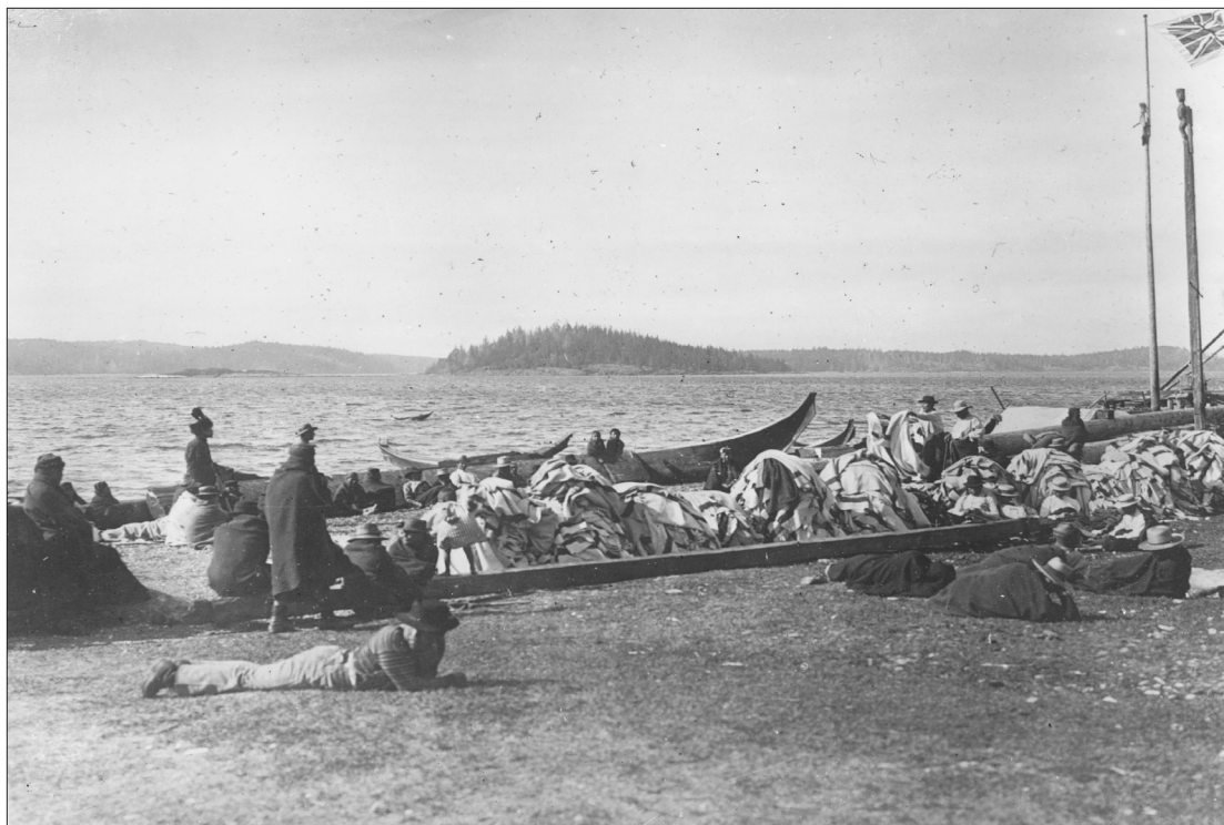
Fig. 6 "Potlatch at Fort Rupert. Piles of Hudson's Bay 'Point' blankets are being counted out for giving away. Haida canoes are drawn up on the beach." Ca. 1890. (Photograph by H.I. Smith. Image Courtesy the Hudson's Bay Company Archives, Archives of Manitoba. HBCA 1987/363-W-114/6.)

culture and the repression of their rights to practise their culture. In the act of stacking drums, Assu makes an explicit reference to the stacks of blankets that were prepared prior to potlatch ceremonies: the blanket was considered an item of wealth and was distributed to guests during the ceremony. Assu is also referencing other visual representations of stacked blankets that emerged from the documentary work of photographers and anthropologists who conducted ethnographic fieldwork along the Pacific Northwest Coast. As seen in the archival image from the Hudson's Bay Company Archives (HBCA) (Fig. 6), one of many examples of such photographs, woollen blankets are seen piled high and deep for their eventual distribution at a potlatch ceremony in a Haida community. Therefore, Assu's "visual quotation" (to borrow a phrase from Patricia Vervoort) of stacked woollen blankets emerges from both ethnographic photographs and oral traditions that commemorate momentous ceremonies of this significant traditional practice not only in Assu's Kwakwaka'wakw community of the We Wai Kai First Nation (Cape Mudge), but along the Pacific Northwest Coast in many First Nations communities (Vervoort 2004: 469).