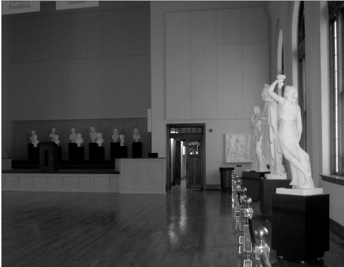
Fig. 6 Plaster casts exhibited in the Barbara Hope Kem Statuary Hall of the Aleen Vogel Webking Alumni Center at Southeast Missouri State University.

subjects in the NMNH are valued as authentic objects within the context of other reproductions in a natural history museum and have thus been retained.