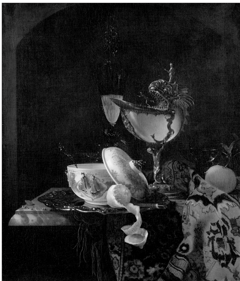
Fig. 1 After Willem Kalf (Dutch, 1619-1693); Still Life with Chinese Sugarbowl, Nautilus Cup, Glasses, and Fruit, ca. 1675- 1700; Oil on canvas, New-York Historical Society, 1858.15.