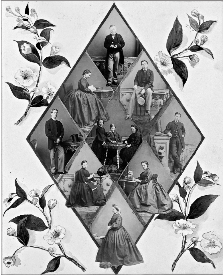
Fig. 1 Frances Elizabeth, Viscountess Jocelyn (English, 1820–1880); Diamond Shape with Nine Studio Portraits of the Palmerston Family and a Painted Cherry Blossom Surround; from the Jocelyn Album, 1860s Collage of watercolor and albumen prints; National Gallery of Australia, Canberra.

exhibition marks the first time that many of these albums have been on public display.