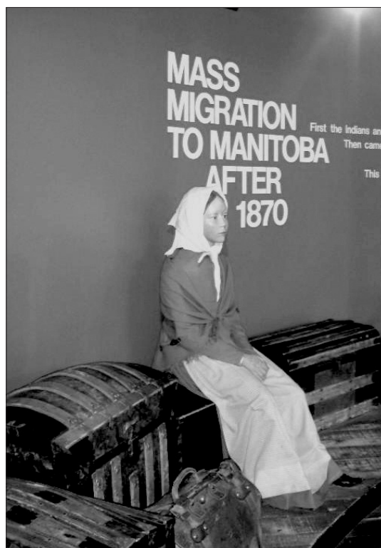
Fig. 5 Mass Migration to Manitoba gallery, Manitoba Museum.

Once shunned from the picturesque displays of the 1920s, trunks became a popular symbol of settlement history from the 1970s onwards. Centennial museum exhibits such as the Manitoba Museum's Mass Migration to Manitoba After 1870 used groupings of trunks as central motifs, as well as educational tools for exploring the role of mass migration as part of a larger chronology of nation building. Upon entering the gallery, visitors met the sole figure of a young immigrant woman seated on a trunk (Fig. 5). Her generic clothing concealed the mannequin's potential ethnic affiliations, since her shirt, shawl and headscarf were made from plain, un-hemmed, pieces of fabric pinned to her body. The display conveys a sense of isolation, poverty and anonymity while providing a generalized vision of arriving migrants. The personal hardship of migrants during transit was also an important component of the Canadian Museum of Civilization's Everyman's Heritage permanent