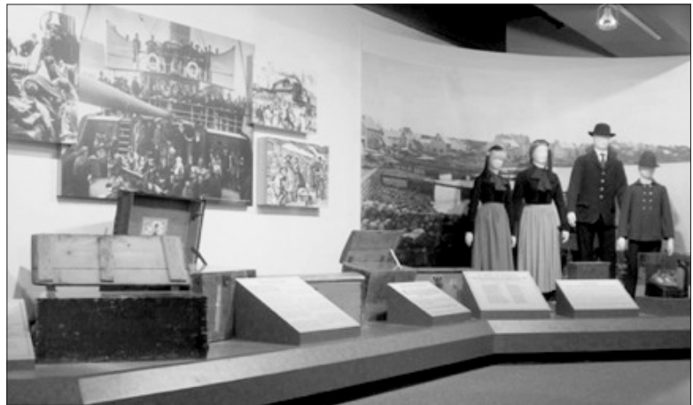
Fig. 6 New Iceland Heritage Museum Gallery in Gimli, Manitoba.

The low cultural value of the objects may be attributed to the decline of religiosity in the community. Migrants brought many religious books that would be of limited interest to more recent generations. More likely, however, Icelandic-language