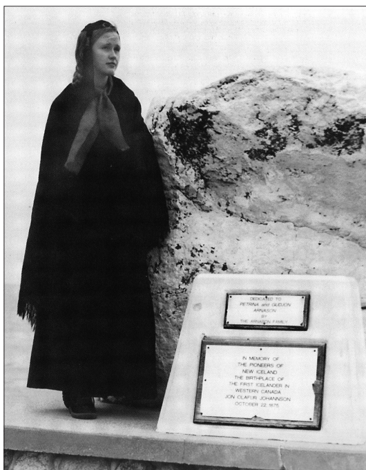
Fig. 9 Girl in Icelandic costume beside White Rock Monument.

At first glance, the decision of community members to retrieve previously "useless boxes" from barns, attics and basements following the creation of multiple visual campaigns celebrating the historical significance and emotional power of these objects, suggests a straightforward appropriation of the new images of the past set forth by heritage agencies. Yet, in this case, prescriptive images of the past and popular material cultural practice are divided on the issue of trauma. In keeping with the spectacles of migration set forth by agencies such as the Canadian Broadcasting Corporation and Canadian Museum of Civilization, public representations of the history of Icelandic communities encourage the identification and commemoration of hardship as a significant, but ultimately redemptive