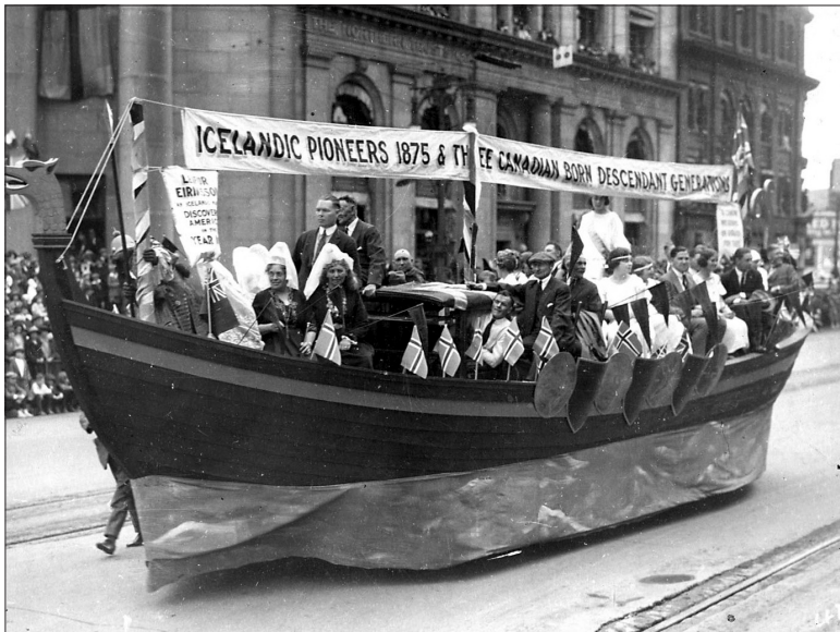
Fig. 2 Icelandic float at Winnipeg's 50th Anniversary parade, 1924.

Norse costumes, wigs and false beards in a depiction of the first meeting of the Icelandic parliament in 930 won first place at Winnipeg's celebration of Canada's Diamond Jubilee. The float informed spectators that Icelanders had not only discovered North America, but had also created the world's first representative parliament.