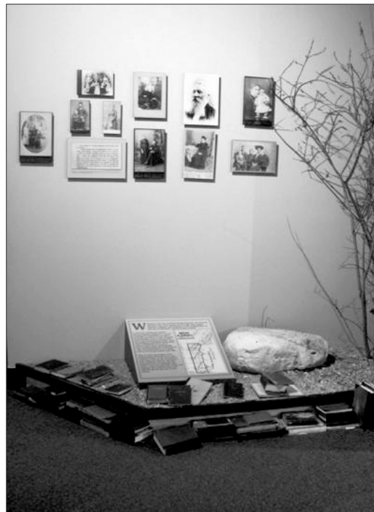
Fig. 8 New Iceland Heritage Museum Gallery display of Icelandic books.

This loss of memory regarding life in Iceland illustrates that although kofforts continue to serve as a mnemonic tool, later generations have constructed new narratives to help identify their roots outside of Canada. Kofforts still offer an