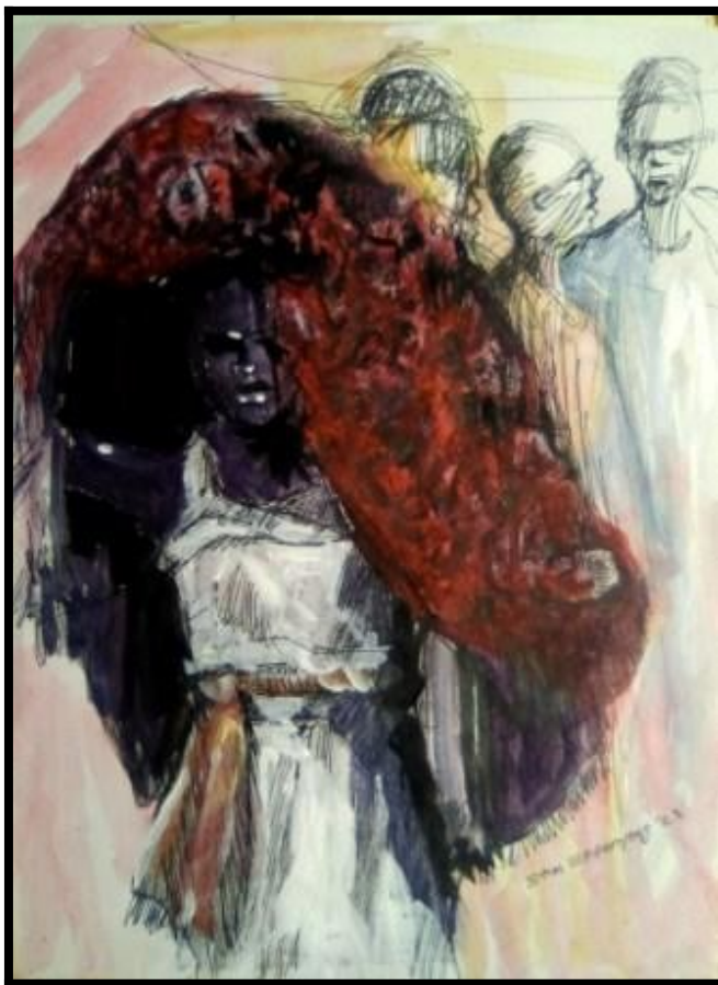
Plate 11: Arugbá is a stylized rendition of the Arugbá as she makes her way to the Osun River to perform her role in the Osun Festival.

The Osun Osogbo Festival, held in the final week of August, is a significant Yoruba cultural event that celebrates the river deity Oshun. Thousands of pilgrims and devotees from across Nigeria converge at the Osogbo Sacred Forest to partake in this vibrant festival. The event is marked by various rituals, sacrifices, and offerings made by priests to seek Oshun's protection and blessings for the coming year (Osun Osogbo Album, 2023). The festival highlights the deep spiritual connection the Yoruba people maintain with their deities and the natural elements that symbolize these divine forces. The celebrations feature elaborate processions, traditional music, dance, and the convergence of worshippers in a communal act of reverence to the goddess Oshun.