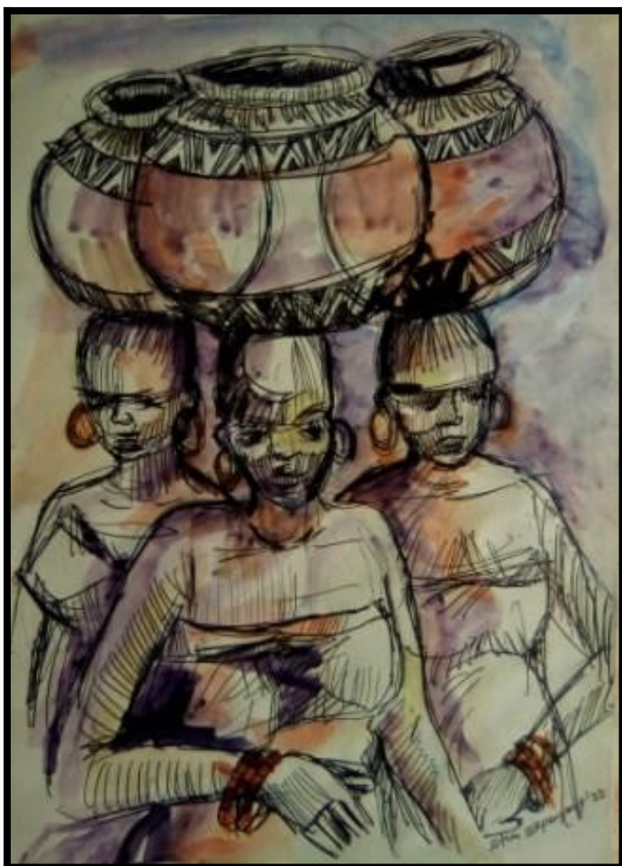
Plate 1: From the Stream is composed of three stylized female figures returning from the stream bearing earthenware full of water on their heads. It depicts diligence and commitment even in the face of adversity.

Title: From the Stream Artist: Etim Ekpenyong Medium: Etimpaste (an alternative water-soluble painting medium) and pen on paper Year: 2023