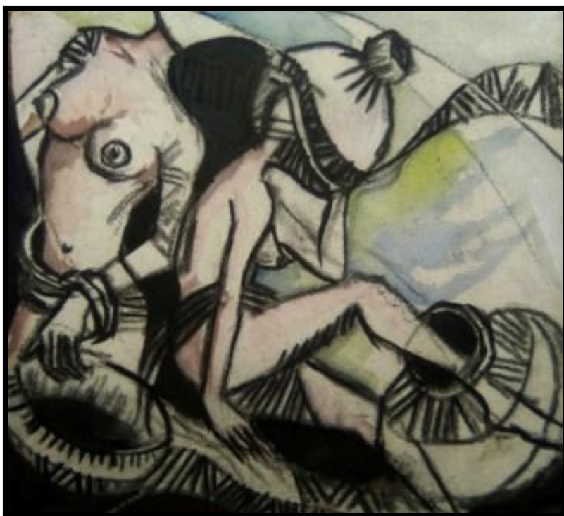
Plate 8: Restrictions is created as the surrealistic composition of two female figures in distress; their distress is due to their journeys to the stream being fraught with danger. There are rapists among the reeds who lie in wait to carry out their evil enterprise.

Title: Restrictions Artist: Etim Ekpenyong Medium: Etimpaste and pen on paper Year: 2023