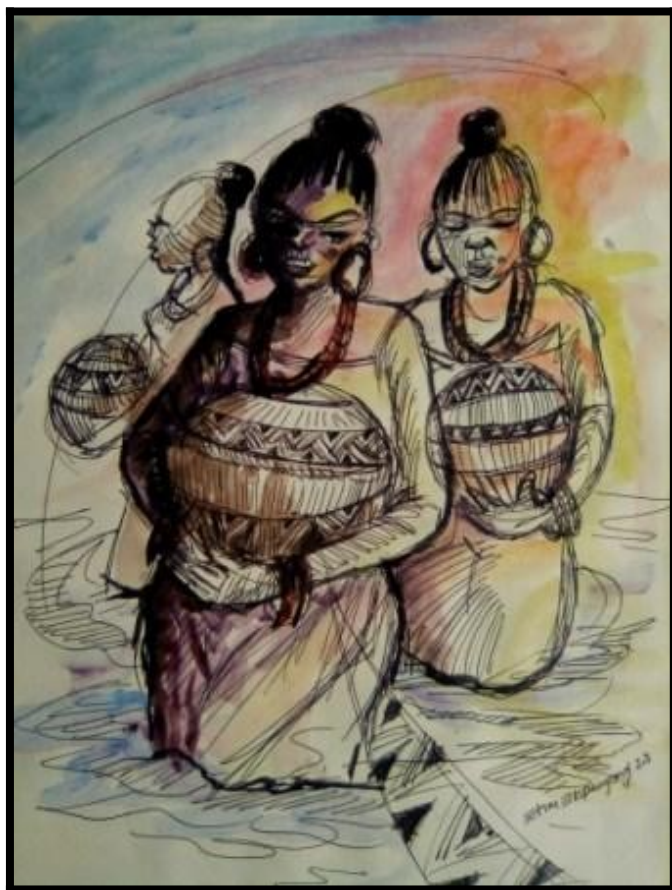
Plate 10: A Sacred Affair is composed of three stylized female figures in the river bearing decorated calabashes in their hand which contain sacrificial items; they are dressed in white wrappers. Their hairdo is elaborate and their ears, necks, and wrists are adorned with coral beads. These women are performing water sacrifice on behalf of their community.

Similarly, in Edo communities, women play key roles in ceremonies dedicated to Olokun, the god of the sea, who symbolizes wealth, fertility, and spiritual depth. These rituals, often performed at water bodies or sacred sites, involve offerings and prayers to ensure prosperity and balance within the community. Across these three cultures, women's involvement in water-related spiritual practices underscores their critical role in maintaining the spiritual and communal health of their societies, reflecting their profound connection to the symbolic and practical aspects of water.