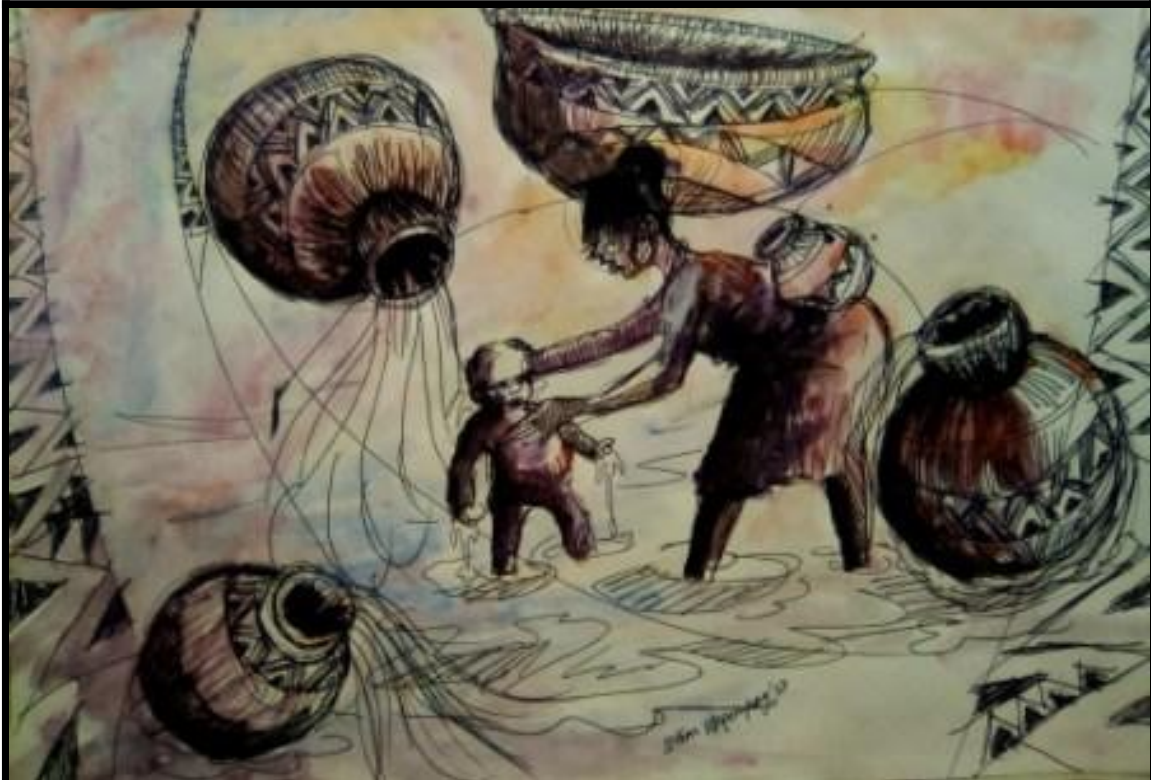
Plate 7: Mother Care is a surrealist rendition composed of a woman bathing her child at the river; there are four pieces of earthenware in the background from which water flows. The mother bears on her back a pot of water like a baby; this depicts how precious water is to her and her household: she depends on this element to effectively take good care of her family.

For those communities that depend solely on streams or rivers for their source of water, they may have to trek for over three kilometres or more to access potable water.