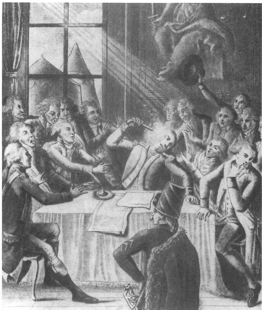
Illustration 4 Bibl. Nat Mort de Beaurepaire.