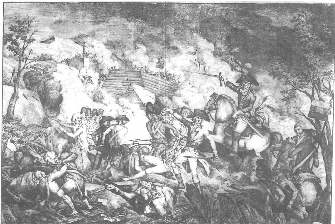
BATAILLE DE GEMMAPE livrée et gagnée par les François sur les Autrichiens le 6 Novembre 1792.

L'armée des Autrichiens dont l'effectif étoit de 35,000 hommes et la nôtre de 30,000, sans compter les volontaires, étoit placée sur une colline, au-dessous de laquelle se trouvoient les villages de Gemmappe, de Seneffe et de Marais. Les Autrichiens occupèrent le point de vue de la colline, et nous nous établissons sur le flanc opposé. Les Autrichiens firent d'abord un feu très-vif, mais nous leur répondîmes avec une telle précision, qu'ils furent obligés de cesser. Nous les poursuivîmes jusqu'à la colline, et les vaincîmes. Les Autrichiens furent tués ou blessés, et nous nous emparâmes de leur camp. Les Français firent prisonniers 1,500 hommes, et nous leur enlevâmes 15 canons, 1000 fusils, et beaucoup de munitions. Les Français firent aussi beaucoup de prisonniers, et nous leur enlevâmes 15 canons, 1000 fusils, et beaucoup de munitions.