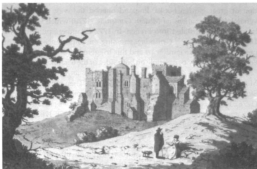
Figure 4 Woodstock Manor. Drawing 1714. (British Library, London)

Hirschfeld: "Aucun [des arts libéraux] n'est allié à [l'art des jardins] d'aussi près que la peinture" 12