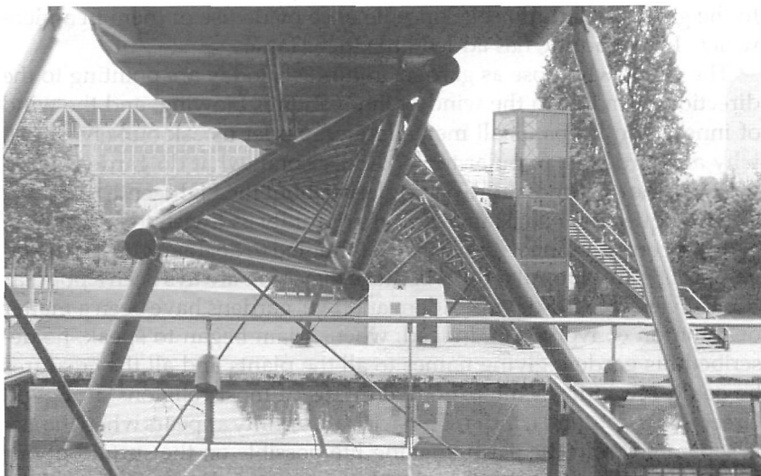
Figure 1 Le Parc de la Villette, Paris. (Author's photograph)

To-day we still have kitchen gardens and ambitious princes, but things have changed and are changing everyday. Kitchen gardens tend to be the luxury of gourmets who grow their own tomatoes instead of buying substitutes — fresh from the hothouse — at the supermarket and, although princes and very wealthy people still have gardens, they do not — at least not always — reserve them for private enjoyment. Besides, large gardens have now become part of our townscapes, and town authorities spend large sums of money designing public parks whose shape and arrangements are discussed publicly and mentioned in the press. Paris has created more public parks since 1977 than in the century following the downfall of Napoleon III. Landscape architects who enter competitions submit projects which express their interest in new technologies and their wish to express the modernity of our age. La Villette is one example [FIG. 1]. The Parc André Citroën is another [FIG. 2]. The modern landscape artist now occupies a position which makes him come into contact with ecology, botany, city-planning, sociology, etc. He dominates the intellectual scene. In Geoffrey Jellicoe's words: 'The world has