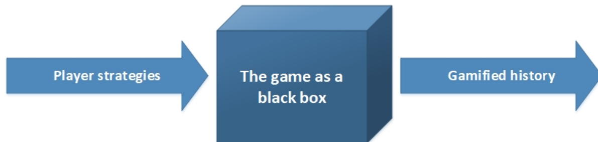
Figure 2. The game black box process.

roleplaying may choose to play and interact with the game as a black box. However, while this approach to EUIV can help the player focus on history, the extent to which they do so will always be dependent on how that player approaches the game. Thus, a black box approach to EUIV shifts the player's attention to engaging in historical roleplay and narratives rather than making choices to primarily maximise player benefits within the game's algorithm.