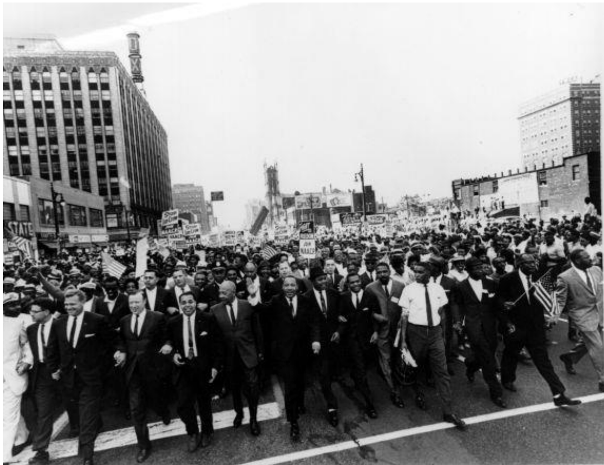
Figure 1. The 1963 Great March to Freedom proceeded along Woodward Avenue (Detroit News Staff, 1963a).