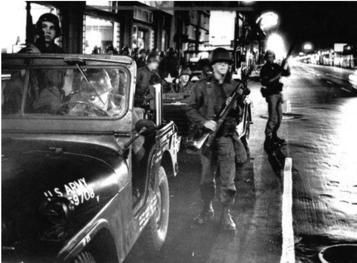
Figure 4. Detroit experienced a heavy military presence during the 1967 civil unrest. (Photo id: 26017, 1967)

The Great March to Freedom ultimately left a less lasting impact than the unrest that rocked the city in July 1967. Frustration with the lack of racial progress—particularly in regard to housing segregation, job inequality, and police violence—four years after King’s rally boiled over at 12th Street and Clairmont. (Kieliszewski, 2017; Smith, 1999, pp. 193-195; Sugrue, 2014, pp. 257, 261). Some Black Detroiters, observing a police raid of a Blind Pig, an illegal bar, began lobbing taunts and bottles at officers on the scene, expressions of discontent that spiraled into widespread looting and property destruction. When police proved unable to restore order, federal troops descended on the city (see Figure 4) with tanks and other military vehicles (Kieliszewski, 2017). Violence reverberated for days, ultimately leaving forty-three people dead and over seven hundred wounded. Many Black Detroiters remember the unrest as a revolt more than a riot, referring to it as the “Great Rebellion” or the “July Rebellion of 1967” (Smith, 1999, p. 195).