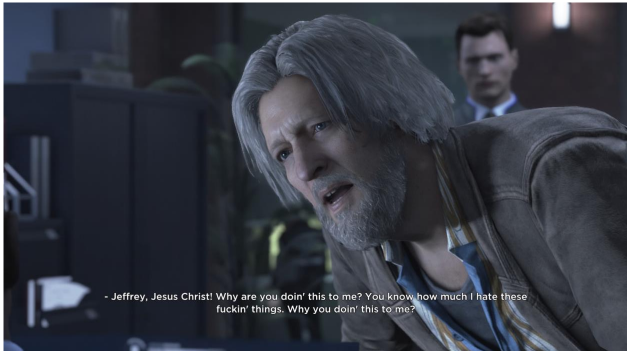
Figure 5. Detective Hank Anderson complains to his captain about being partnered with an android as Connor stands silently in the background. Screenshot taken from Detroit: Become Human