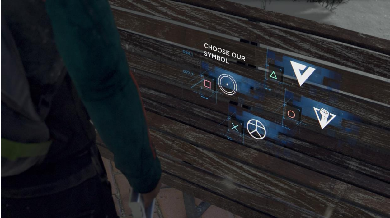
Figure 2. Messaging for the movement. Screenshot taken from Detroit: Become Human

chooses the path of peace or violence, the police arrive on the scene and kill nine of Markus' compatriots, reminding the gameplay that change does not often come easy. The gameplay must decide whether to exact revenge on two officers or to embrace the philosophy of non-violence. Subsequent news reports refer to the androids as terrorists, though the public will grow more supportive of the cause if the officers were not killed and property damage proved minimal. Markus later leads a demonstration down Woodward Avenue (see Figure 3), following roughly the same route that the Great March to Freedom took seventy-five years earlier.