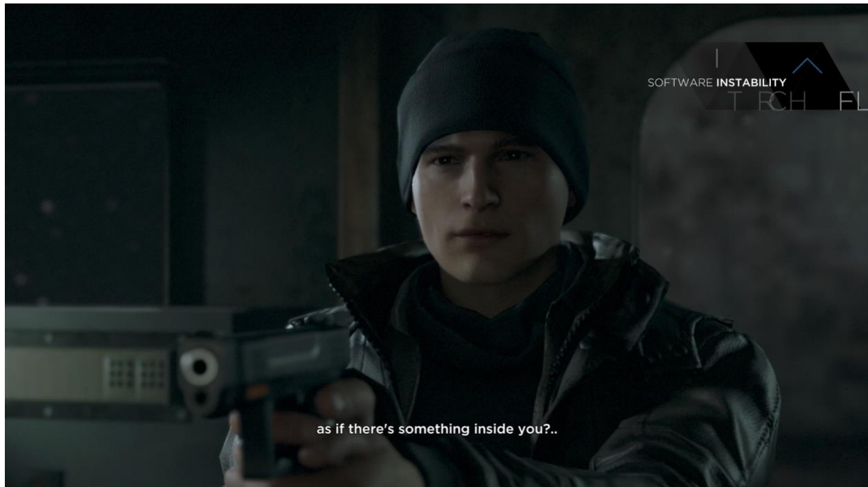
Figure 6. Connor wrestles with his two identities throughout the videogame.