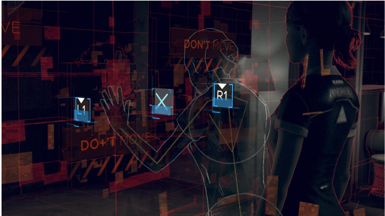
Figure 8. Like Janie in Hurston's classic novel, "something fell off the shelf" inside Kara so that "she had an inside and an outside now." Screenshot from Detroit: Become Human .