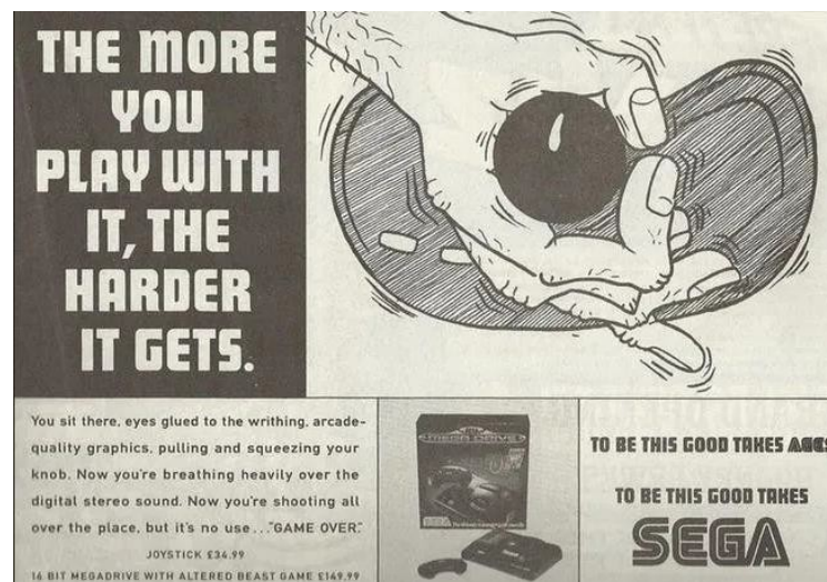
Figure 1.5. Sega mega drive advertisement mapping self-masturbatory phallic play and death to the joystick

Yet entering text into Animal Forest requires that players to navigate both phallic and clitoral analogues by pairing rhythmic button presses with rotating and flicking the joystick, a feeling of writing that is disruptive to historic narratives of writing as a strict analogue for cisgendered male sexual activity. As Phillips concludes, such observations are merely disruptive as they still perpetuate in a problematic gendering of gameplay and game hardware; however, given the largely heteronormative cisgendered rhetorics circulated about players, hardware, and writing, the feeling generated by Animal Forest's writing system presents an important rejection of these analogues.