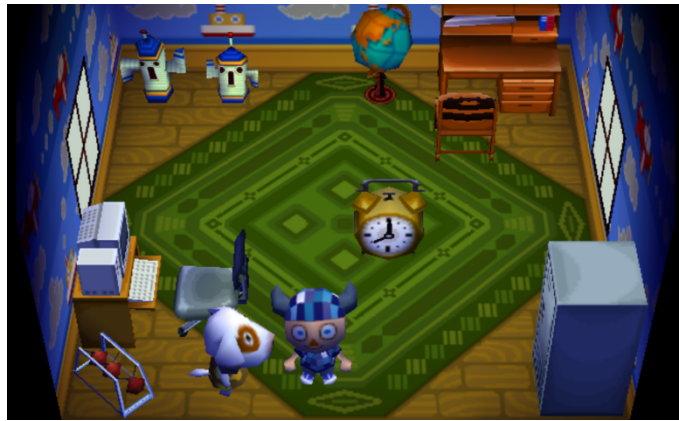
Figures 2 and 3: The dog himself and his questionable taste in interior decorating

Above all, though, Bones was an exceptionally nice dog, a real salt of the earth pooch. He was my friend's favourite villager bar none. Alas, in Animal Crossing just as in life, time marches on and even best of chums must sometimes be parted. And so, one day when my friend boarded the bus to school and sat down next to me, I could tell something was amiss. He had some heavy news: the night prior, Bones had confided in him that he planned to move away. I offered my condolences since, in those days, once a villager had told you they were moving, there was nothing you could do. One day they'd be gone without a trace, back into the aether of the game's code.