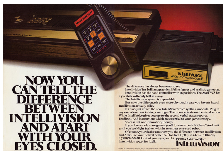
Figure 2: ad featured in Electronic Fun with Computers and Games

The Intellivoice’s normalization of video game voices as White and male is visually established in Intellivoice’s lone video ad. The TV ad confirmed the voice of the Intellivoice as belonging to