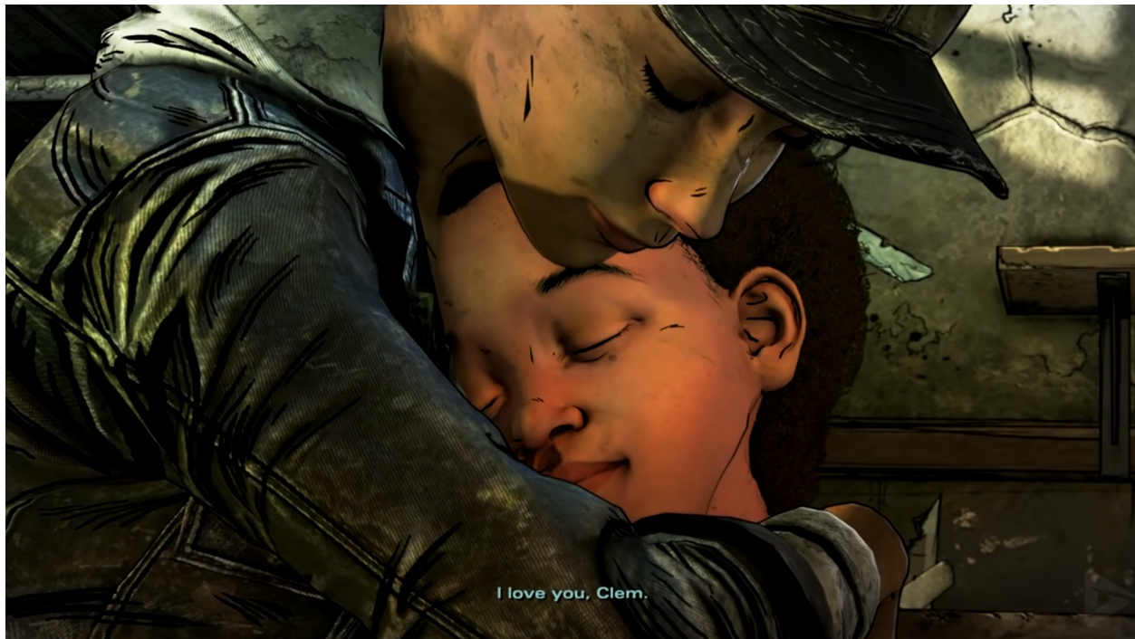
Figure 6. Clem and AJ share a tender moment. Screenshot taken from The Walking Dead: The Final Season

Importantly, although there is a lot of violent action in the final season, there are also several moments of teaching, caretaking, and tenderness between Clem and AJ. For example, AJ asks Clem how to get rid of his trauma, admits how terrified he is of losing her, and they say “I love you” to each other and hug (see Figure 6 ). These moments echo the interactions between Lee and Clem in S1 and send the message that Clem is a good mother, just as Lee was a good father.