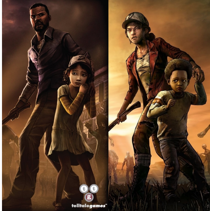
Figure 7: Screenshots of the cover art from The Walking Dead: Season One and The Walking Dead: The Final Season