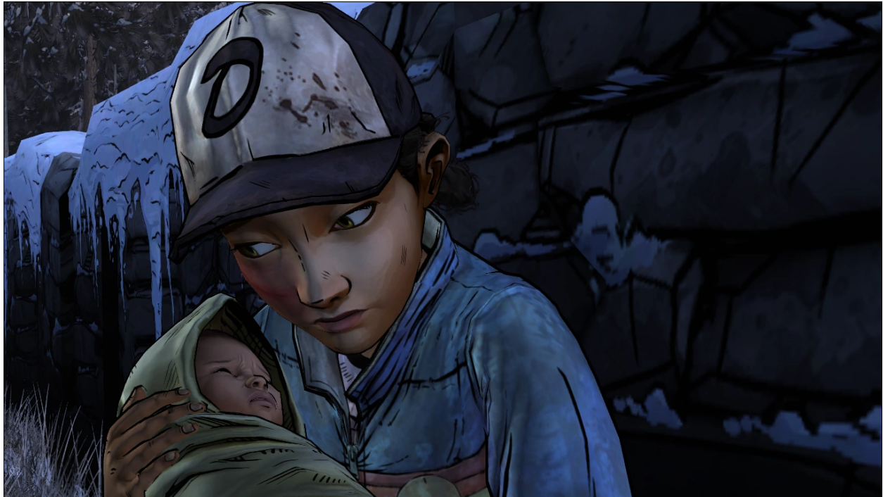
Figure 3: Clem and AJ. Screenshot taken from The Walking Dead: Season Two

giving him another chance at fatherhood. 2 He admits that he failed to raise his late son like he should have and vows not to make the same mistakes raising AJ. However, following Kenny's death later in the episode, Clem becomes AJ's sole parent.