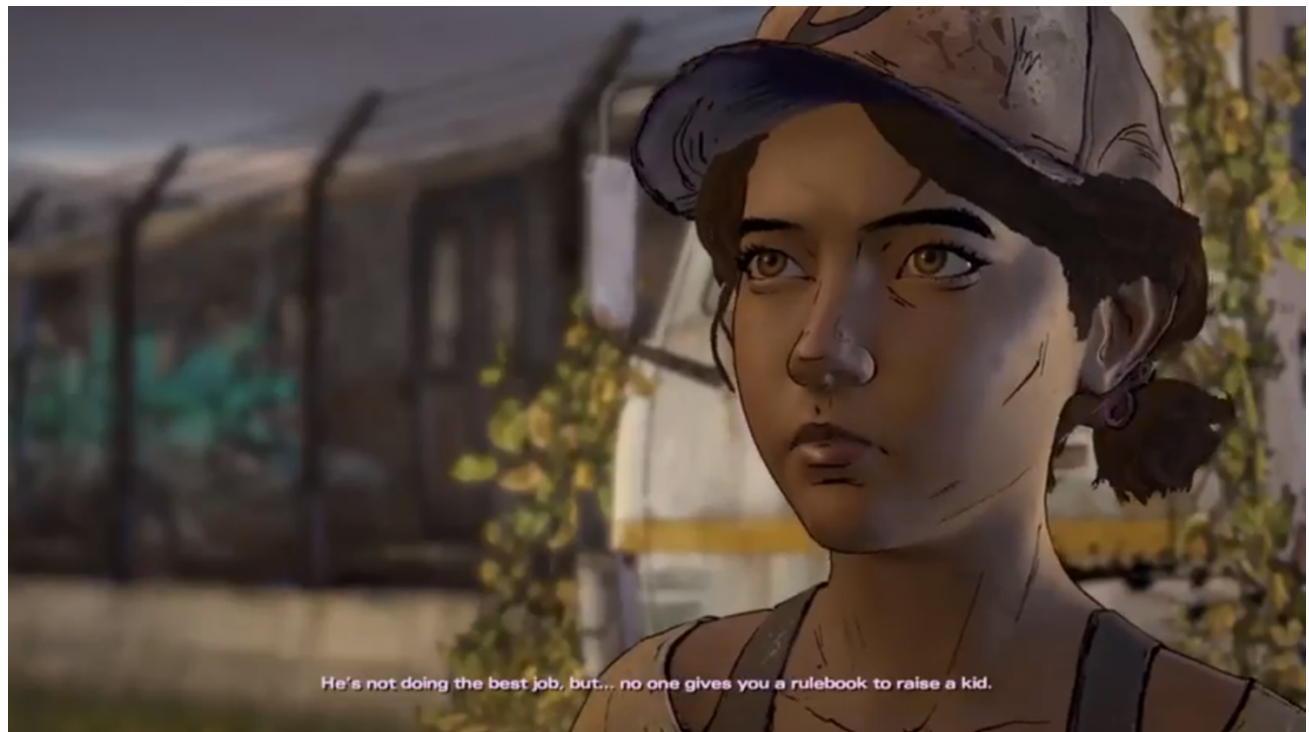
Figure 4: Clem. Screenshot taken from The Walking Dead: A New Frontier

Another example occurs in a conversation between Clem and Javi: although Javi is not a father-figure for Clem, he is tasked with explaining menstruation to her in one memorable scene. Clem knows that it is normal, but no one ever explained to her what it means, so the player can choose for Javi to tell her that her body is changing and that it means she could become a mom if she wanted. This moment of care is reminiscent of the way Lee interacted with Clem when he cut her hair – slightly awkward due to stereotypical masculine discomfort with feminine topics but enacted with kindness and honesty. However, the most notable element in this scene is Clem’s reaction to Javi’s explanation: “Funny. I already felt like a mom. Kenny used to say I was a natural-born mother” (S3; see Figure 5 ). This statement is followed by a flashback in which players see Clem, Kenny, and AJ around a campfire. Kenny tells Clem that she’s the only “mama” that AJ has, and that she is “protective, loving, caring... All the things a good parent needs to be and all at your age” (S3). Clem already felt like a mother, regardless of her reproductive biological functions and age, and she believed, and was told, that she was good at it.