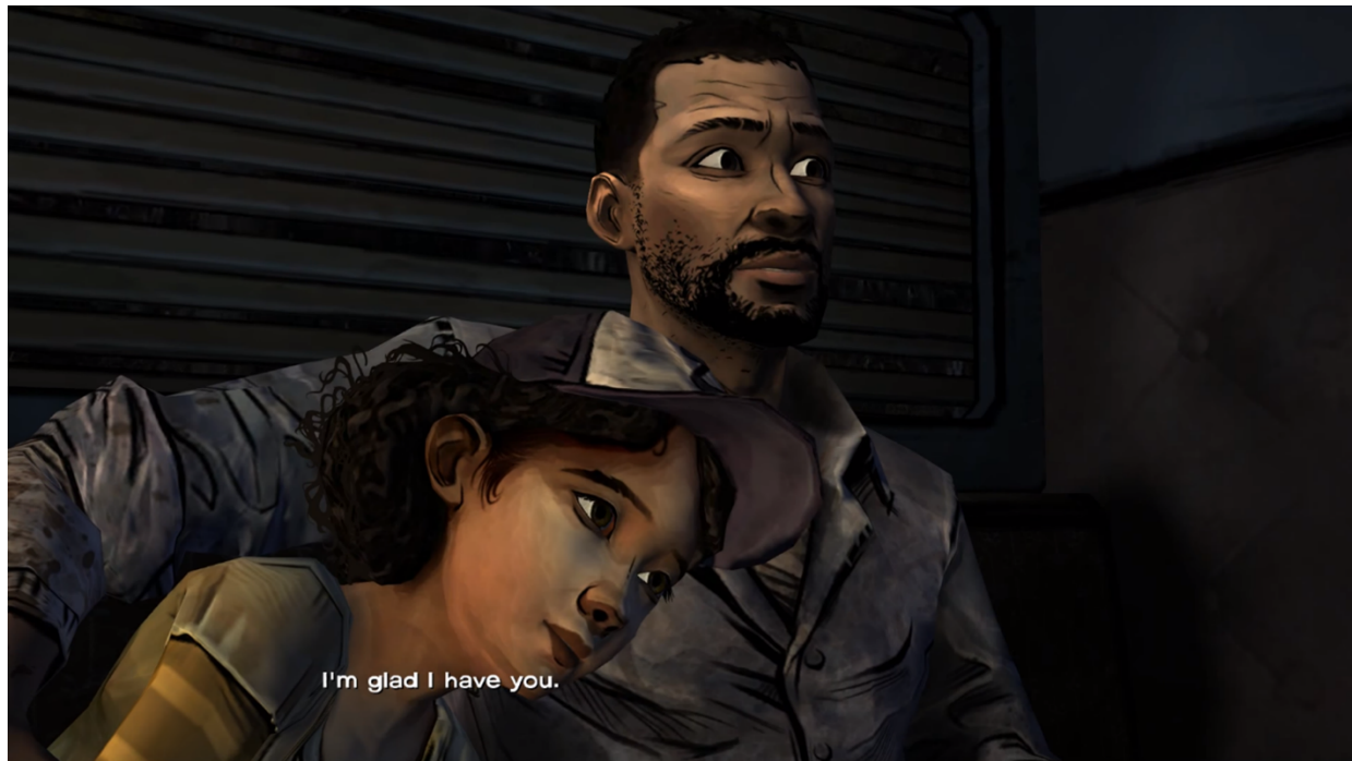
Figure 2: Lee and Clem. Screenshot taken from The Walking Dead: Season One