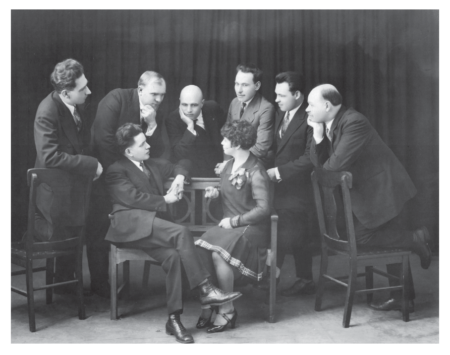
The directors of the Workers' Theatre Studio in Winnipeg, 1920s.

ULFTA was considerable. Under his tutelage, a regional network of performing arts groups was established. In an average year, they performed approximately 800 plays and 550 concerts, and even travelled to the United States and the Soviet Union to hone their craft in the off season. By 1928, there were 56 drama-choral groups and 76 mandolin orchestras across the country.<sup>23</sup>