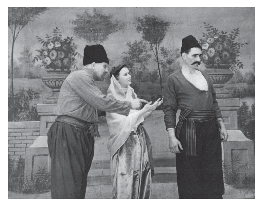
Members of the Workers' Theatre Studio performing Yaskravi Zirky (Bright stars) in Winnipeg, 1935.