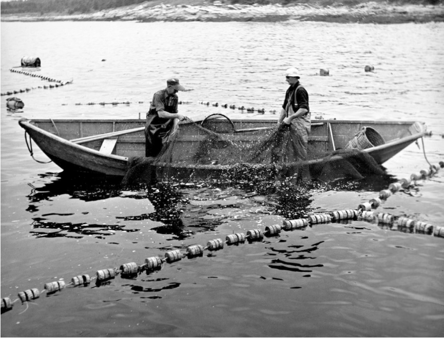
Arthur Griffin, "Christmas Cove, Maine, Sardine Fishing Brining in the Sardines," 1944. Griffin Museum of Photography. Digital Commonwealth, Massachusetts Collection Online. https://www.digitalcommonwealth.org .

from the local weir fishermen, who wholly controlled the supply, that they were forced to pay the fishermen, according to US Fish Commissioner Hugh Smith, "a very much larger figure for their fish than the business will warrant." 52