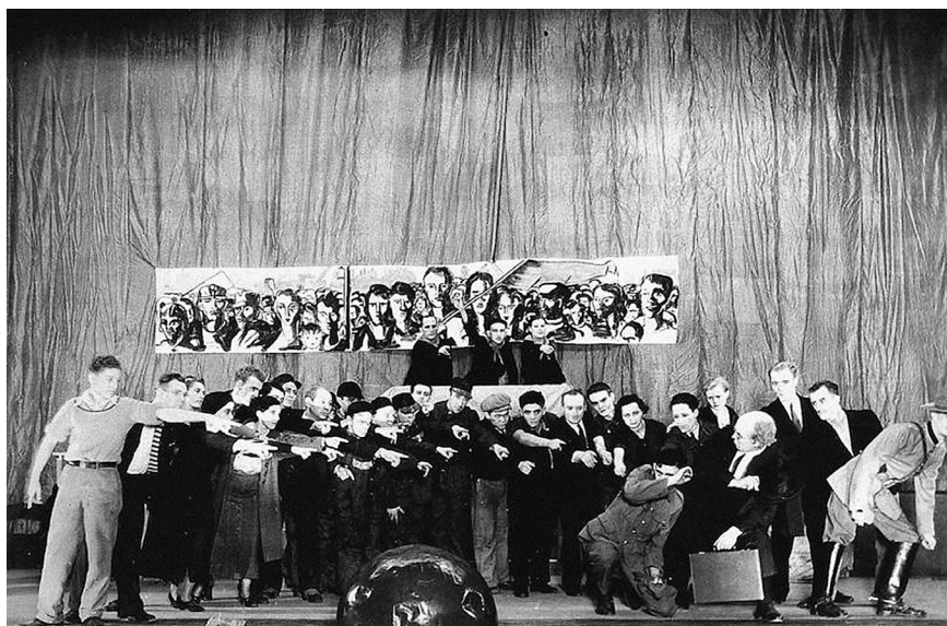
The jailing of CPC leaders stimulated the production of the play Eight Men Speak . This photograph was taken at the Standard Theatre in Toronto, 4 December 1933.