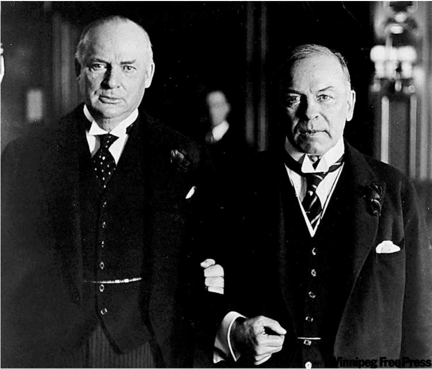
Prime Minister R.B. Bennett, who incarcerated the CPC leaders, arm in arm with his Liberal successor William Lyon Mackenzie King.