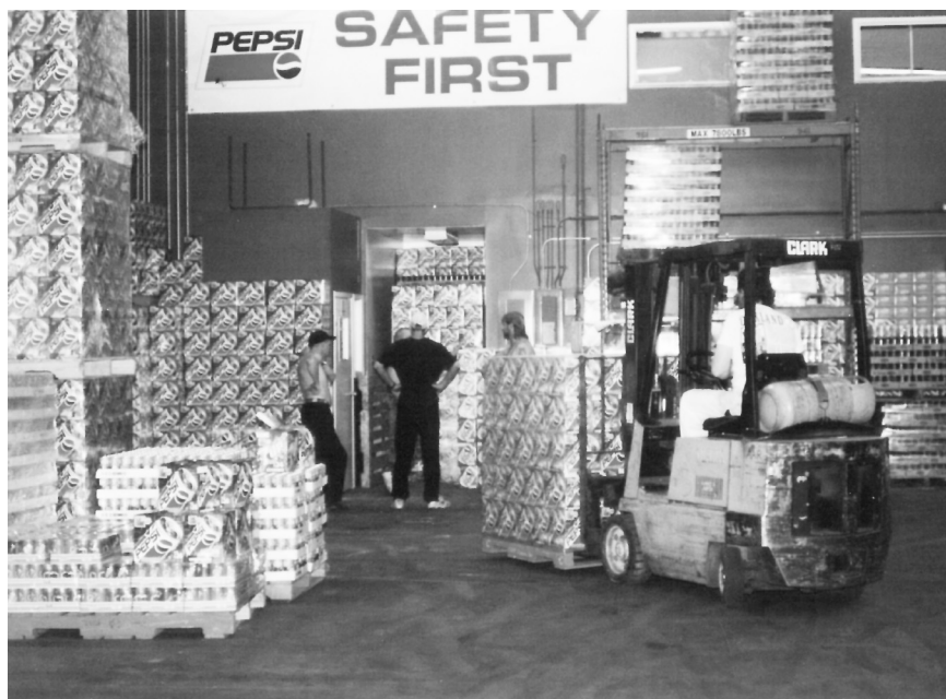
Plant Occupation. RWDSU Saskatchewan Files