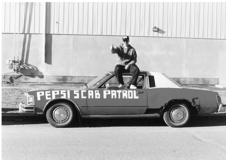
Pepsi Scab Patrol 1. RWDSU Saskatchewan Files