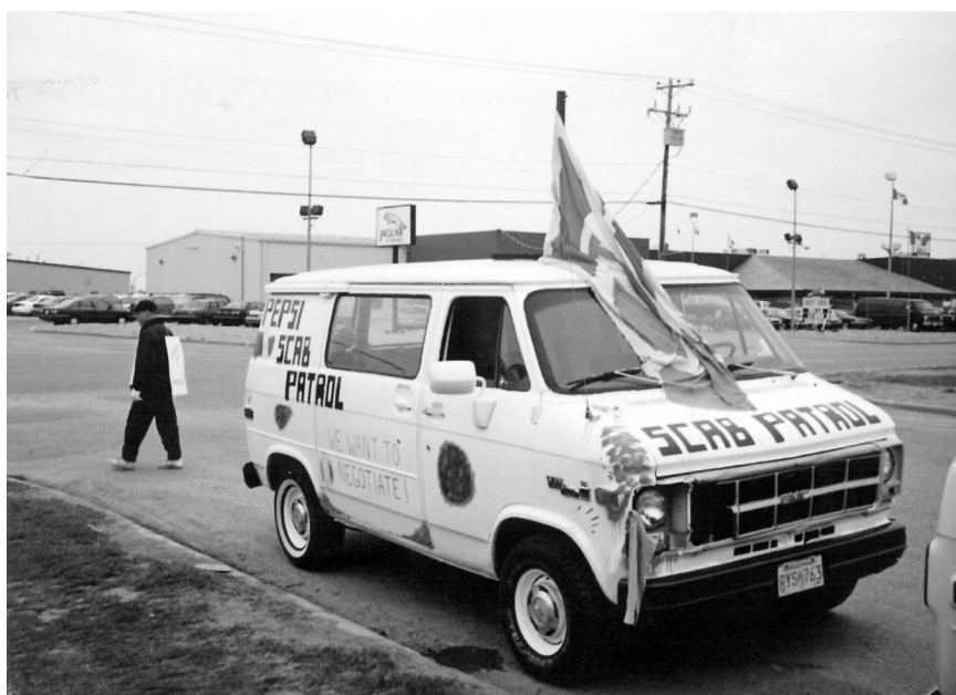
Pepsi Scab Patrol 2. RWDSU Saskatchewan Files