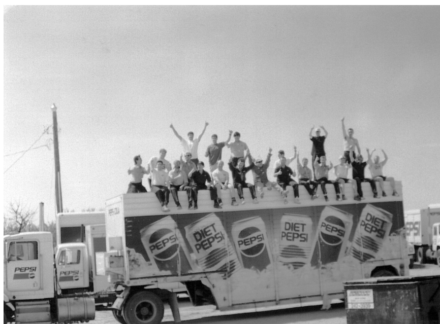
Stratagem Session. RWDSU Saskatchewan Files