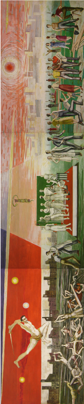
Plate 3: Miller Brittain, The Place of Healing in the Transformation from War to Peace (1954), 156 x 729 cm. Collection of Horizon Health Network, reproduced with the permission of the estate of Miller Gore Brittain.