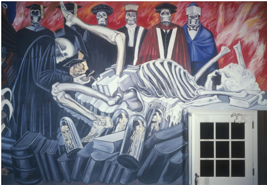
Plate 7: José Clemente Orozco, Epic of American Civilization: Gods of the Modern World (1934), in situ Baker Library. Commissioned by the Trustees of Dartmouth College, Hanover, New Hampshire.