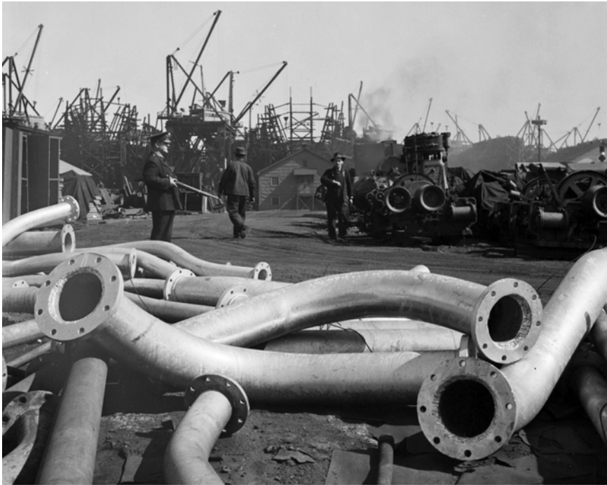
An armed guard stands on duty amidst ship parts in the stores yard of United Shipyards Limited, Montreal. The yard's six berths are visible in the background.