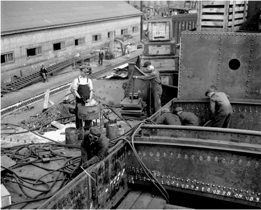
Men at work on a 10,000-ton dry cargo ship in a Montreal shipyard. Note the burner at left operating an oxy-acetylene torch. Behind him standing on deck is a heater with his portable furnace for heating rivets. At the right a group of workers include a riveter and a holder on.