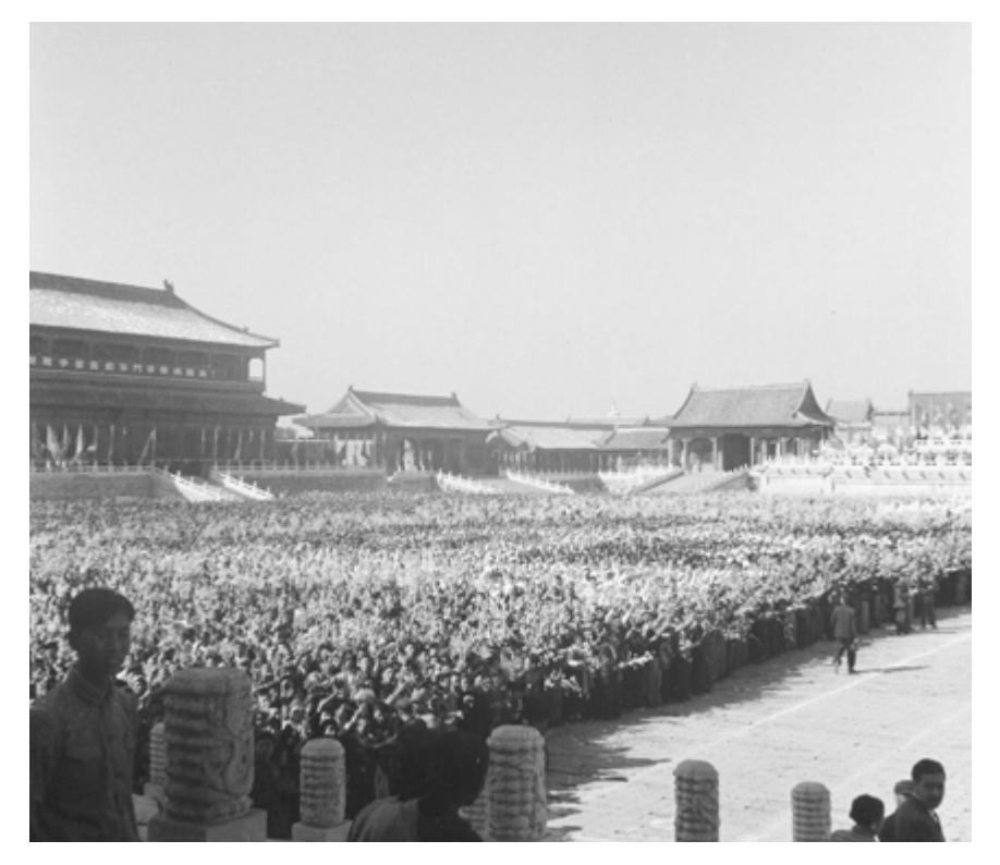
Peace Meeting, Square of the Temple of Heaven, Beijing, 13 October 1952.