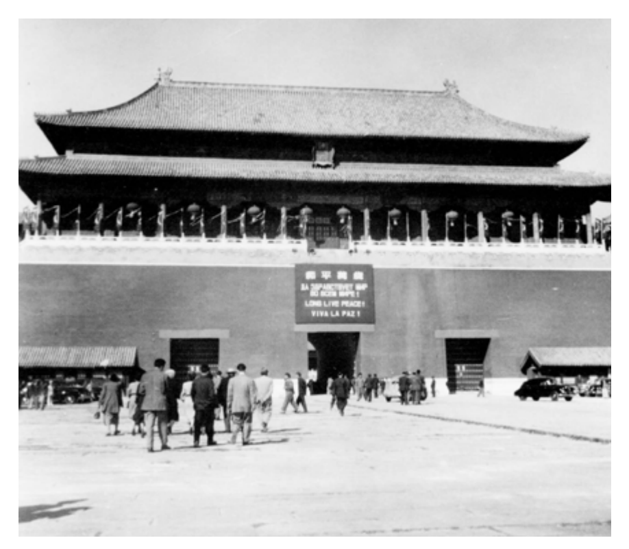
Asia-Pacific Peace Conference, Beijing, China, 2–12 October 1952.

the fact that this was the second International Peace Conference to be held in China; the other taking place in Shanghai in September, 1933.