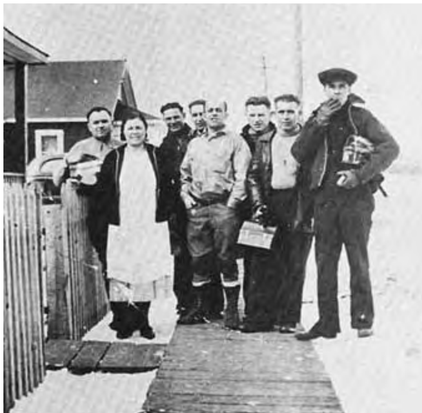
A Coniston Ukrainian boarding house operator and her Ukrainian boarders, circa 1930.

were cunning or abusive; memories of boarding houses as sites of pleasure alongside those that spoke to danger.