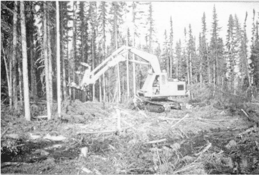
Early feller-buncher.

feller-forwarder. Not only was it more numerous, it has persisted to the present while feller-forwarders have disappeared. 36