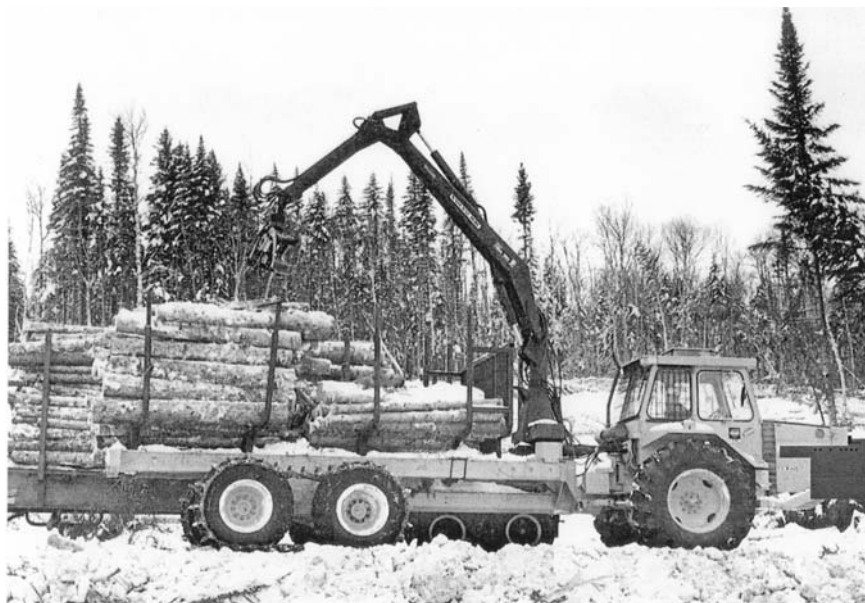
A contemporary forwarder.