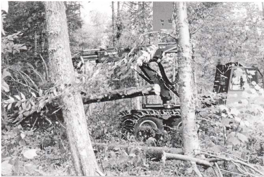
A Single-grip Harvester.

The next developmental stage in the shortwood system was marked, for the first time, by the appearance of Scandinavian technology. The arrival of the dou-