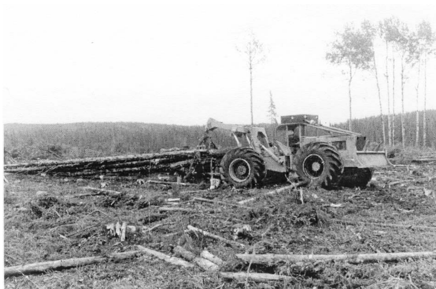
A grapple skidder.