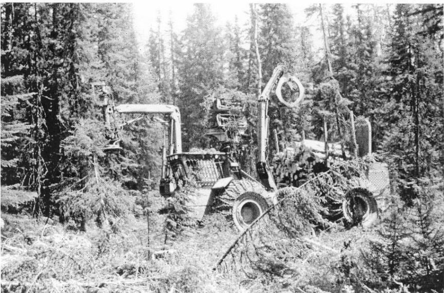
Koehring Shortwood Harvester.