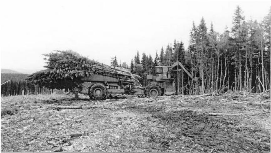
A Feller-forwarder.

Though the final two stages were approximately conterminous, the feller-buncher stage possesses a much greater developmental significance than that of the