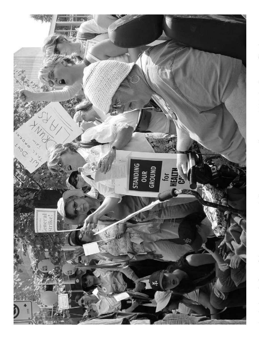
On the lawn in front of the Vancouver Art Gallery at May Day rally, 1 May 2004.