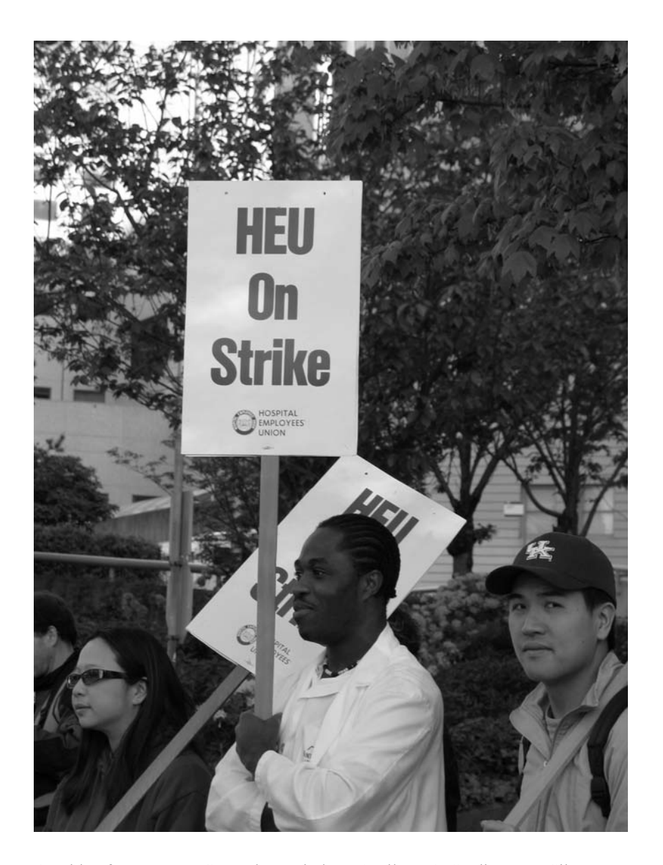
Outside of Vancouver General Hospital, 27 April 2004.