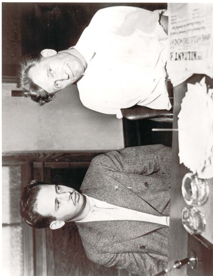
Max Shachtman and James P. Cannon, detained by US military, Minneapolis General Strike, 1934