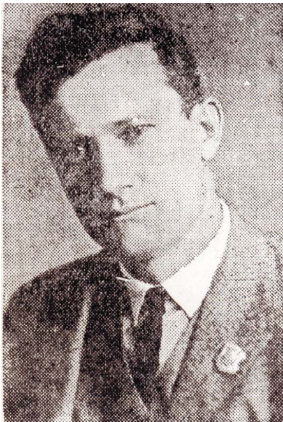
James P. Cannon, mid-1920s, Workers Monthly .