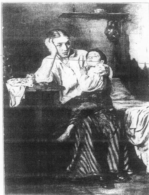
БЕЗ СРЕДСТВ ДО ЖИТТЯ.

ІЛЮСТРОВАННИЙ ЖУРНАЛ — ВИХОДИТЬ ДВА РАЗИ В МІСЯЦЬ