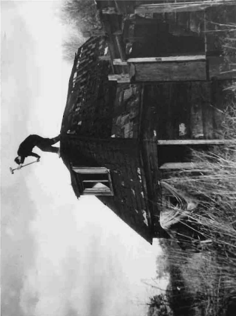
Figure 12. Demolishing a Boathouse.