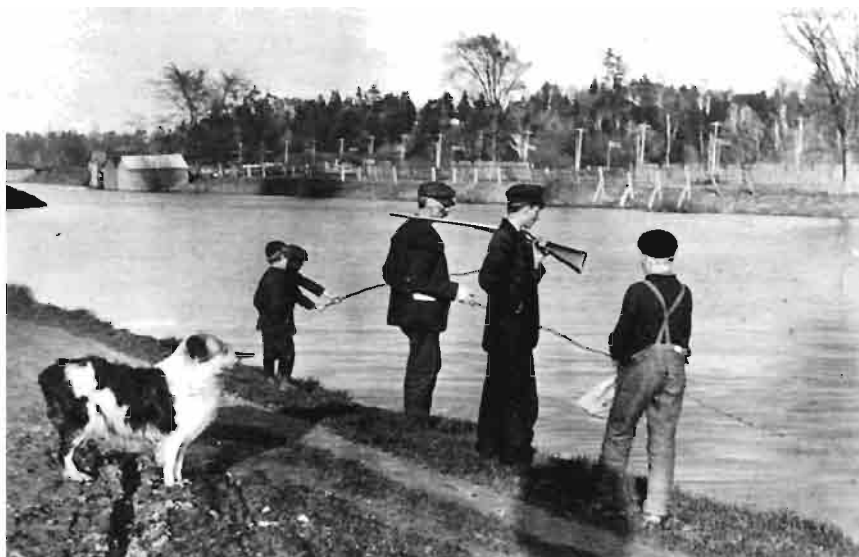
Figure 6. Pot Hunters at the Canal basin, Dundas. Using shotguns and homemade fishing poles to bag their catches, working men and their families of the boathouse colony survived on the plentiful game in the area until the designation of Cootes Paradise as a bird and wild-life sanctuary in 1927.

nocuous activities for kids of the area. “It seems to simply swarm with children,” a reporter from the Herald noted approvingly in 1924, at a time when Hamilton, like many other urban places throughout the country, wrestled with the problem of determining what sorts of recreations were morally appropriate for the city’s youth. Recreational programs sponsored by the parks board aimed to get kids off local street corners and into socially-sanctioned activities on supervised grounds. The area provided “a great natural playground” for them. The Herald argued that overall, kids living in the boathouses did not do all that badly by their unsupervised surroundings. For example, they fared quite well when it came to nautical pursuits, and they swam far away from Hamilton’s dangerous industrial waterfront and its busy wharves that so concerned city officials. 34 Clad in makeshift bathing suits (though more often au naturel ), they took to the water at a very young age. Many were said to be experts in swimming back and forth between the canal and Carroll’s Point on the north shore. This activity helped certain boys on to victory in Hamilton’s annual Playground Association Swimming Championships. Best of all, the high level