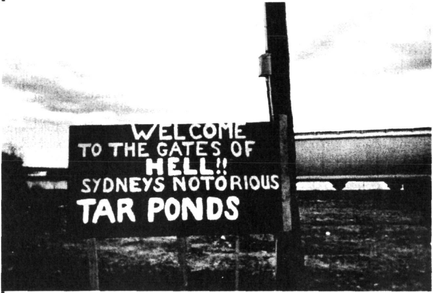
Figure 2: Waiting for the big dig: Intercolonial Street, May 2002.