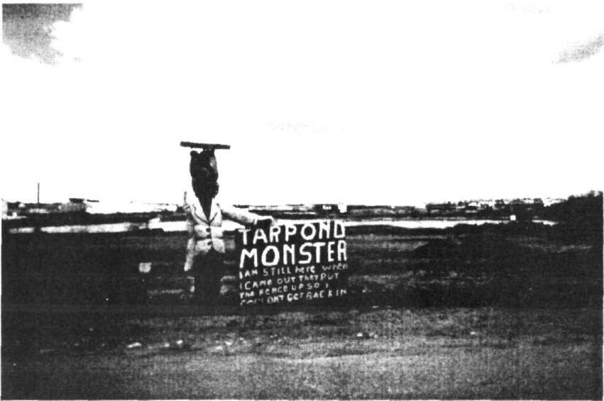
Figure 3: Paradise lost: "Tar Pond Monster," Intercolonial Street, May 2002.