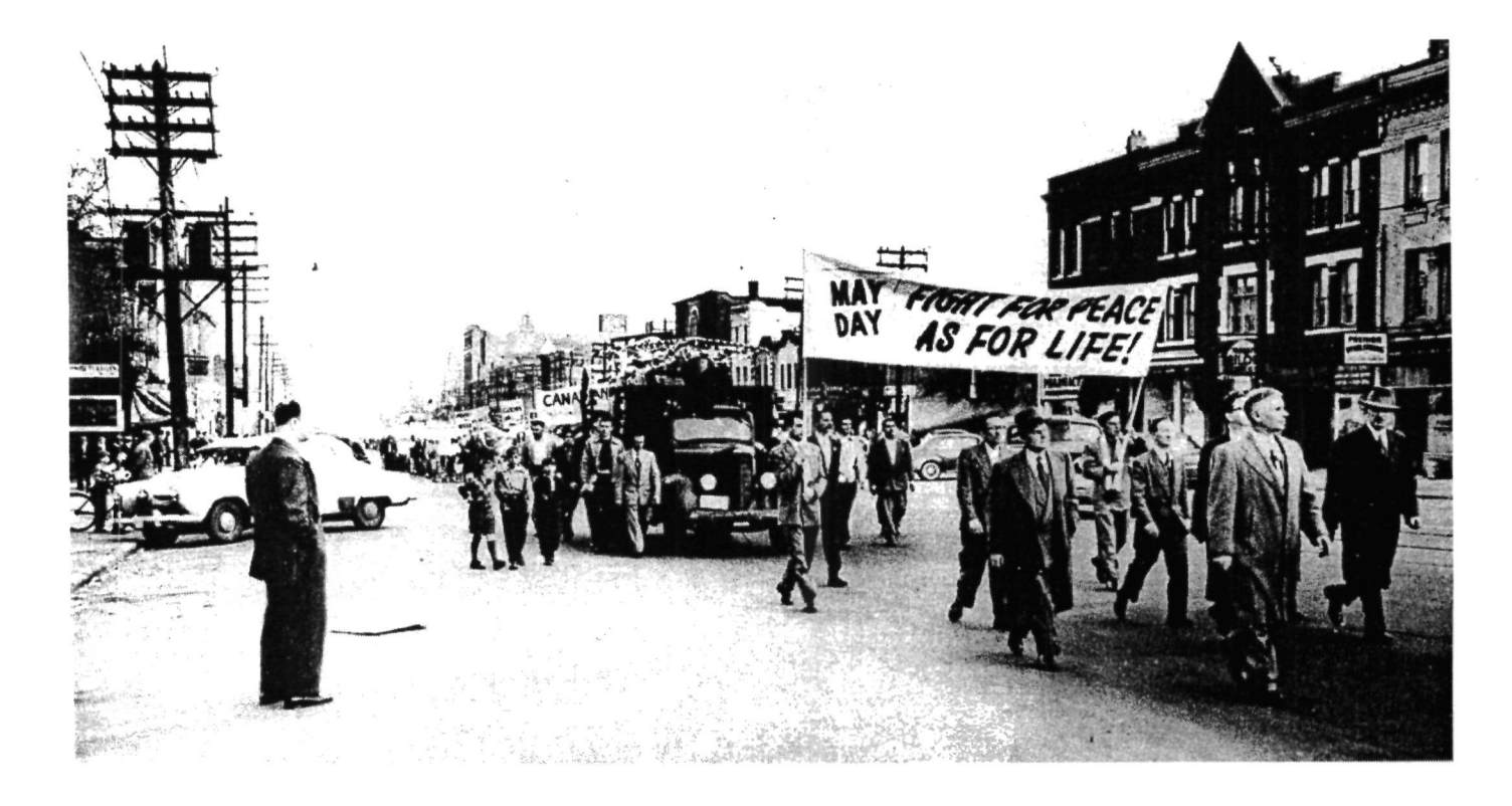
Figure 2. "May Day Parade, c. 1951." As found in Rosemary Dunegan, Spadina Avenue (Toronto 1985), 147.