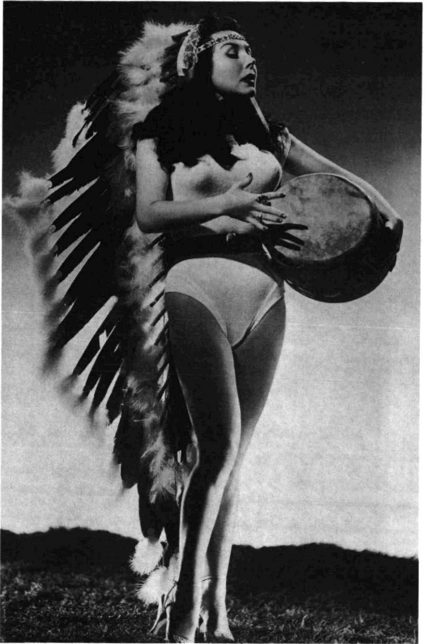
Figure 2: Princess Do May