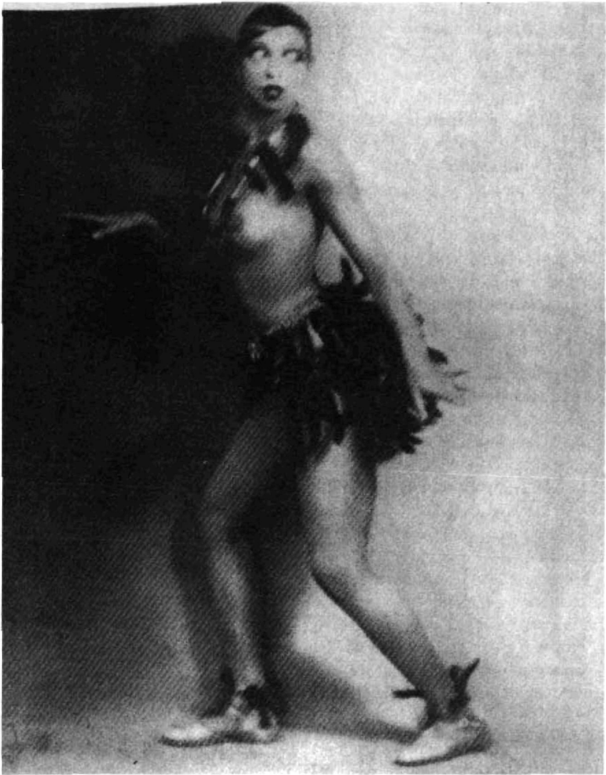
Figure 1a: Josephine Baker

later appeared in Vancouver in the 1950s. Cast in the show, “La Revue Negre” as a “tribal, uncivilized savage” from a prehistoric era, hence consigned to “anachronistic space,” Baker was rendered intelligible and digestible to white Parisian voyeurs. 84 Narrating the fantasy of the jungle bunny — the oversexed object of both white European fascination and repulsion — she danced in banana skirt and