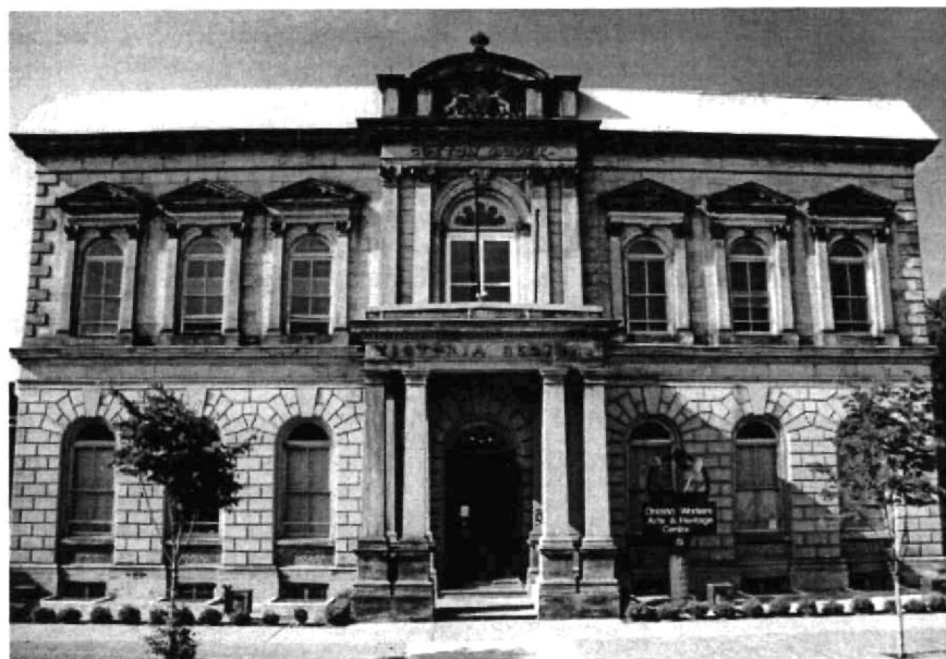
The Ontario Workers Arts and Heritage Centre (formerly Hamilton's Custom House, built in 1860).

skills to dig deeper into a specific subject. 22 They also recognize the need to communicate to the less well-informed, just as in their undergraduate classrooms or their talks to labour audiences. From its earliest 19th-century forms, the museum was always seen as an educational tool that paralleled other forms of cultural diffusion such as public schools, and, however much museum practices have changed, the didactic, educational role remains predominant. Yet, for the historian, in many ways, the move into public history has meant stepping onto a stage where the script and stage directions are much less familiar. A few historians have worked sporadically with local history societies and museums, and some have begun to teach courses in public history to undergraduate and graduate students. But most university-based historians have never done this kind of work, nor been trained to undertake it. Moreover, it is not highly valued within the academic reward system of tenure and promotion, nor supported by most agencies of scholarly funding. 23