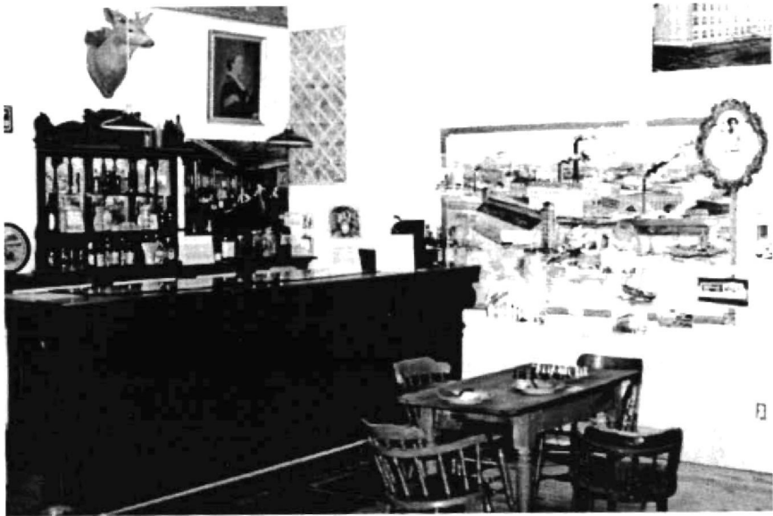
A turn-of-the-century saloon in the 1998 OWAHC exhibition "Booze: Work, Pleasure, and Controversy."

the chance to contribute to a catalogue or handout, but the space is limited, and the prose must be sparse. They are exhorted not to write out their books on the wall, since visitors to heritage installations have little tolerance for excessive wordiness. 60 Most of their written contributions to public history are short paragraphs mounted on text panels alongside or embedded within a display. Far more of their analysis must be communicated visually (or perhaps orally) through the selection and presentation of artifacts, the arrangement of space within the exhibition, and the use of lighting and sound. Museum installations are also increasingly interactive, involving hands-on contact with displays and access to CD-ROMs, interactive videos, and motion-activated lighting and sound. Historians' expertise rarely extends to these media. As an American museum administrator has suggested, "an exhibition or a historic site is much more than the written text of labels and conveys much more complex information through spatial relationships, visual images, real things, and social interactions in a three-dimensional environment that is social, multisensory, and largely self-directed." 61