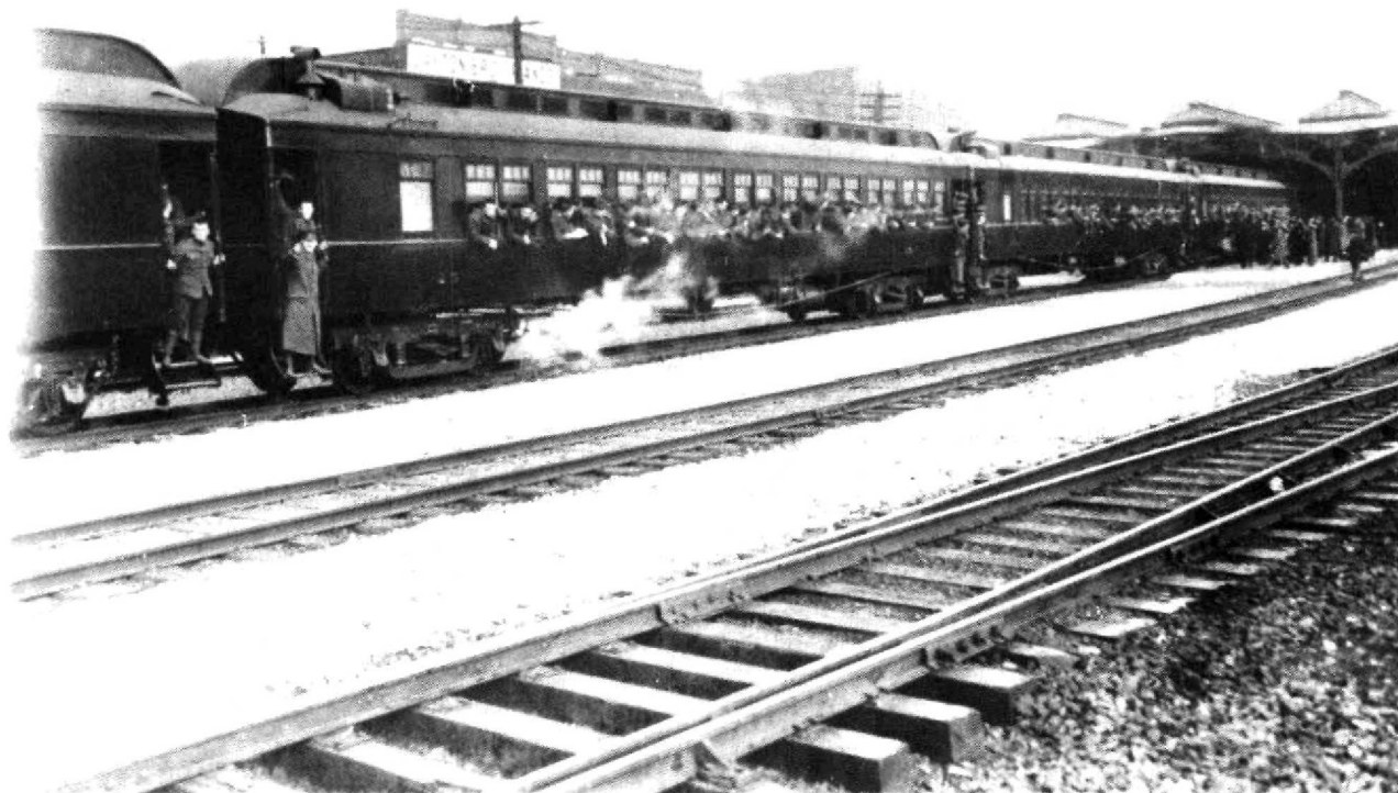
Canadian Troops leaving Windsor Station, Montreal.