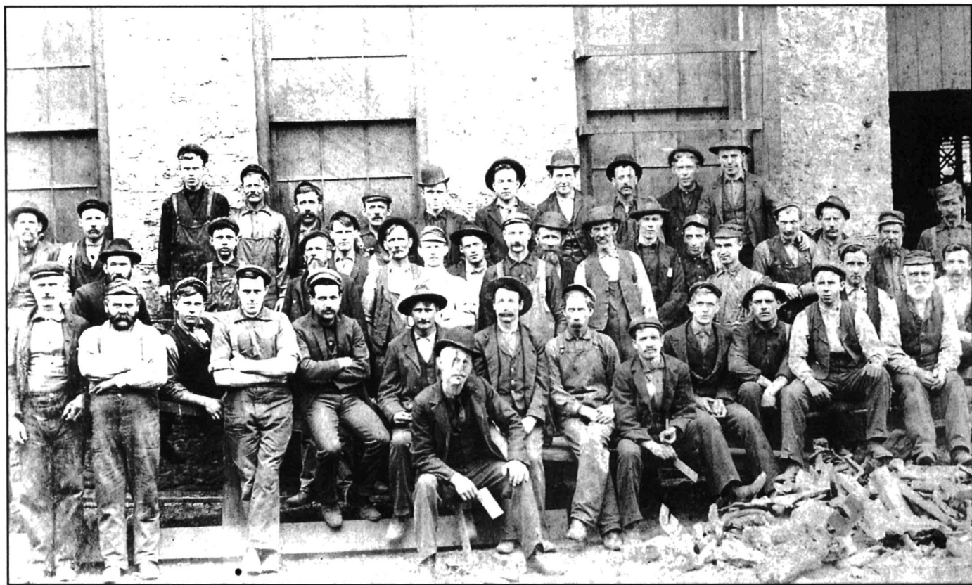
A group of workers outside the Goldie & McCulloch Foundry circa 1890.