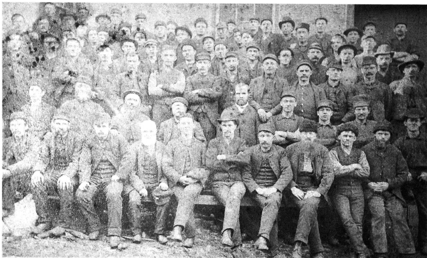
The workers of Cowan & Co. produced engines, boilers, and a variety of machinery.