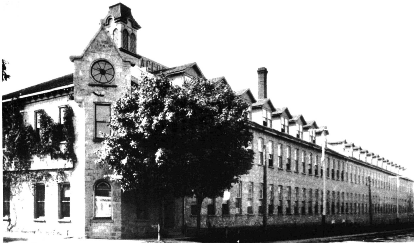
The MacGregor, Gourlay & Co. factory of Concession Street in Galt, circa 1895, produced iron and woodworking machine tools.