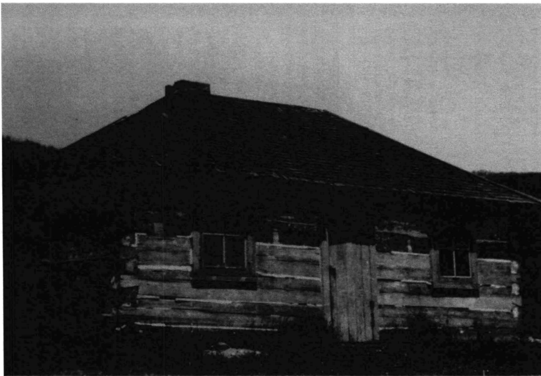
Fig. 4. Fort Wellington guard house where soldiers were held prisoner for drunkenness, fighting, and other misdemeanors. The building has been demolished.