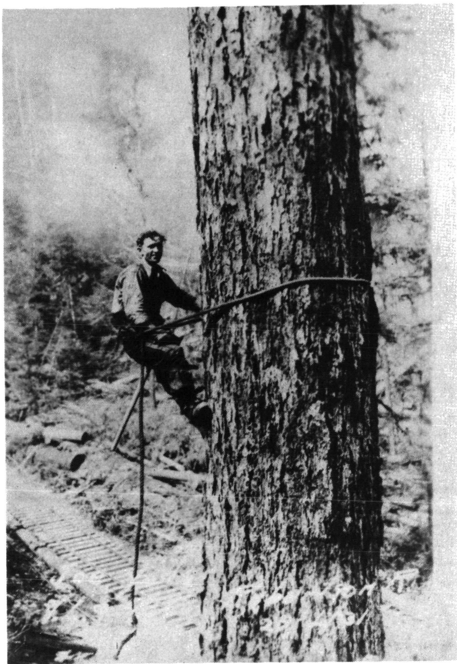
Victoria Lumber and Manufacturing Company high rigger at Cowichan Lake, Vancouver Island.