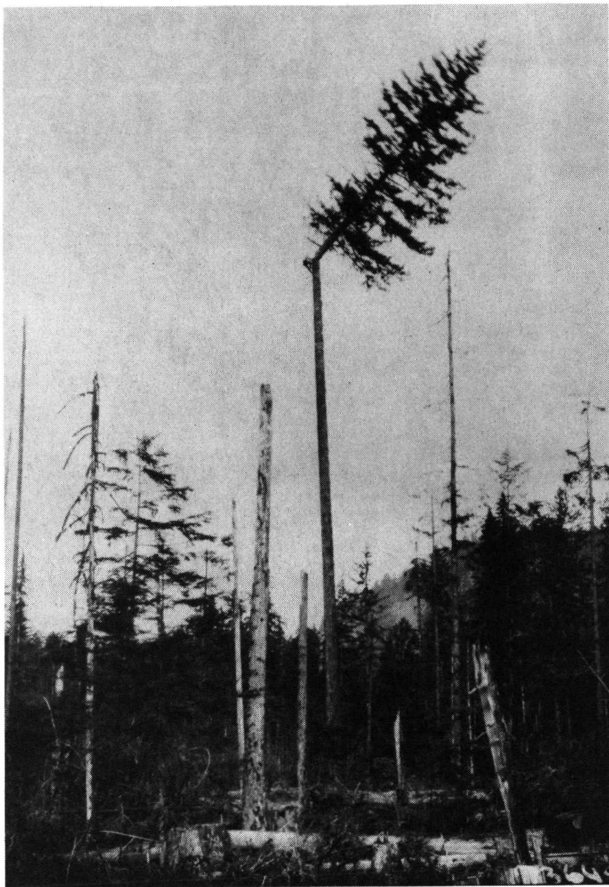
High rigger topping spar tree. Photograph #73645, B.C. Archives and Records Service.