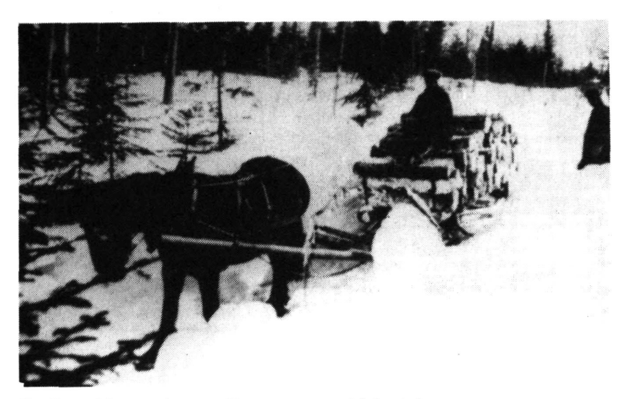
Hauling with a single team.

The...concession was arranged in order to help out lumbermen who will remain in the camps one month, and avoid their having to look for passes through the Relieving Officers and others if they are fortunate enough just to break square. It might help to make the men more contented and will keep them off the dole at any rate for a month if they will remain.<sup>33</sup>