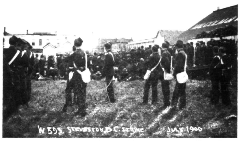
The militia face the strikers. The 6th Duke of Connaught's Own Rifles at Steveston, BC, during the strike in the Fraser River salmon fishery, July 1900. This dispute was mediated by E.P. Bremner.