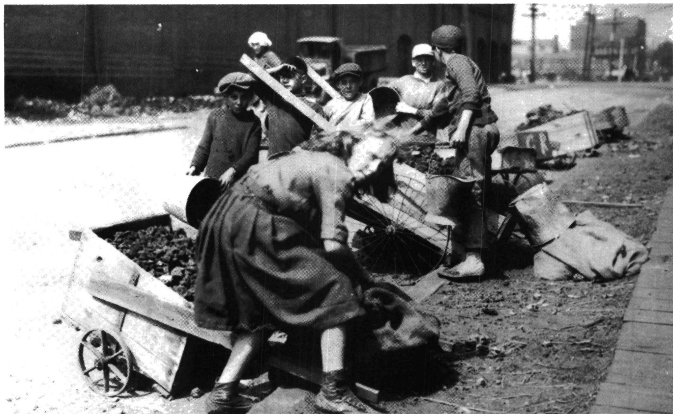
Toronto children picking over cinders, discarded by the Gas Company, for use as fuel: 31 August 1923.