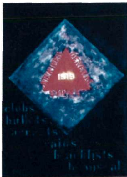
10. Drawing, 1983. Watercolour and acrylic on paper, 28" x 36" (approx.)