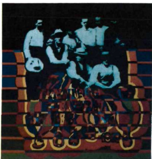
11. Stony Mountain #14, c. 1982. Acrylic and photo on canvas, 4' x 4'.