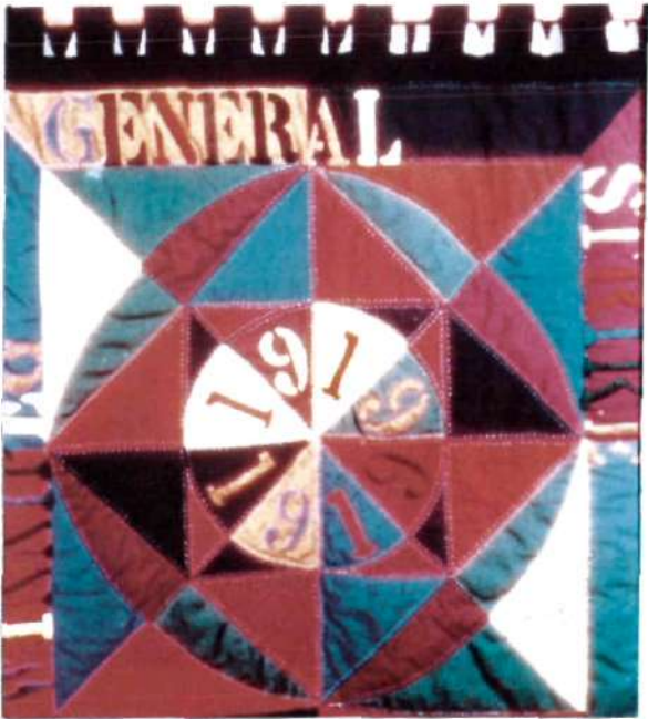
3. 1919 Quilt #3, 1970s. Quilting and applique, 32'' x 32'' (approx.)