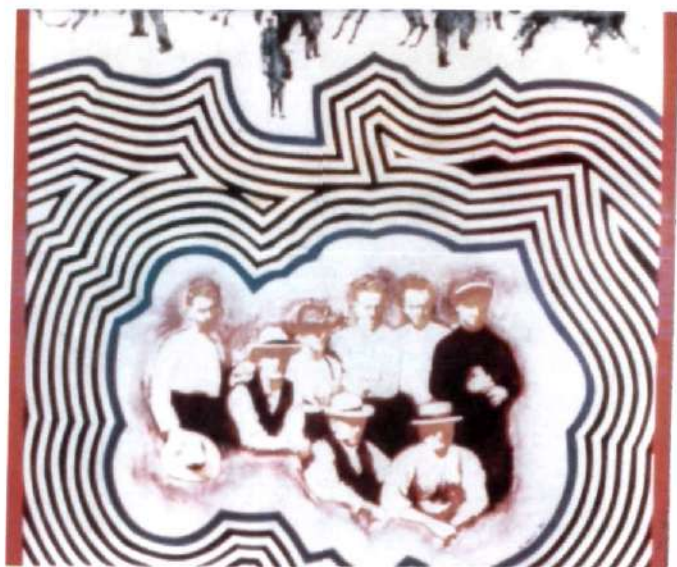
5. Stony Mountain Group #20, 1982. Acrylic on canvas, 4' x 4'.