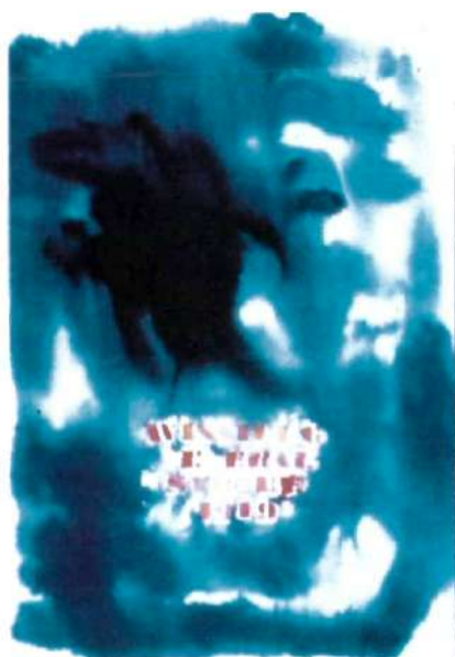
12. Drawing, 1983. Watercolour on paper, 24" x 36" (approx.)