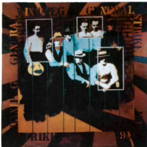
9. Stony Mountain #10, 1980 - 82. Acrylic on canvas with photograph, 4' x 4'.