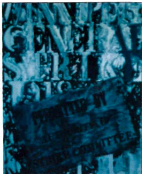
7. Painting, 1970s. Acrylic on canvas with collage, 32" x 42".