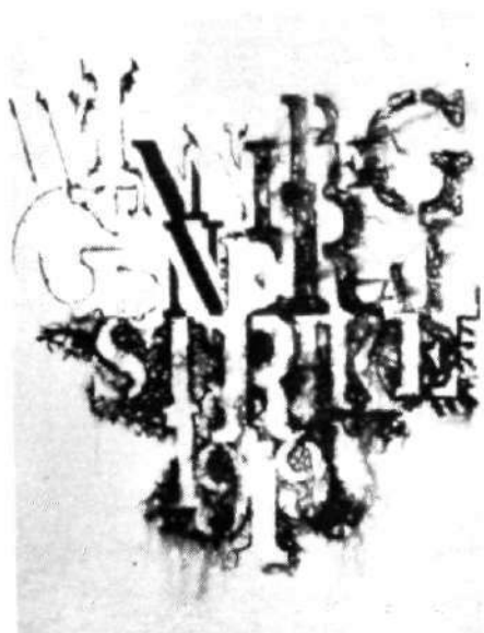
13. Drawing, 1985. Ink on paper, 15" x 22".