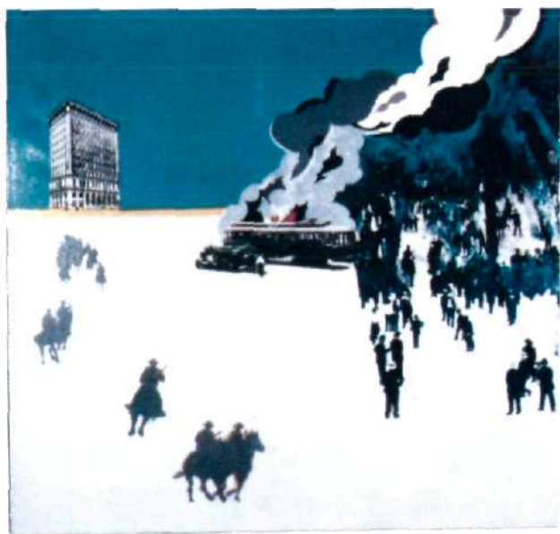
1. Winnipeg Streetcar 1919 #15, 1970s. Acrylic on canvas with photograph, 4' x 4'.