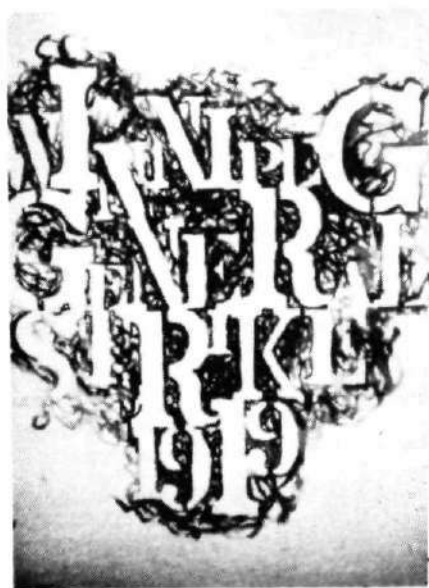
8. Drawing, 1985. Ink on paper, 24" x 36".