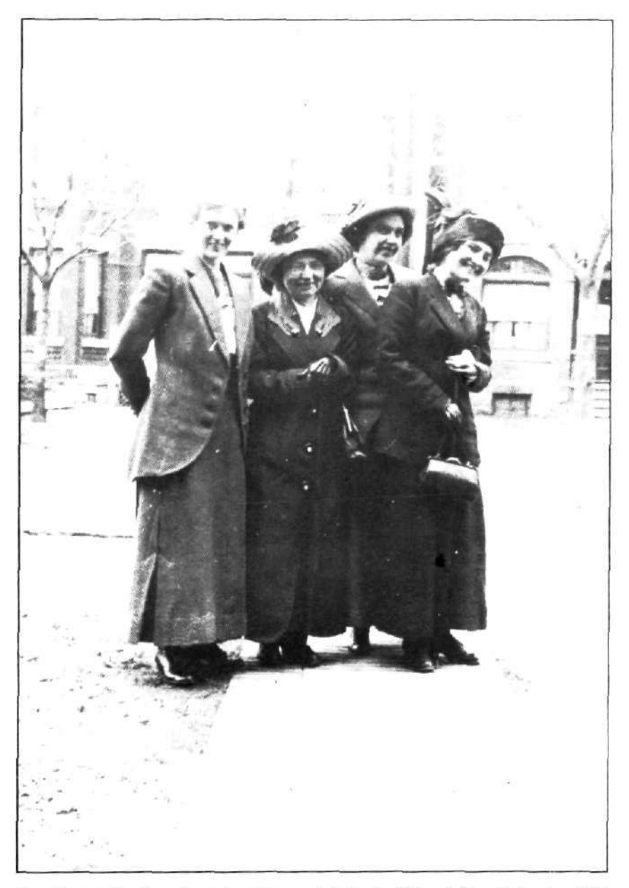
Four Toronto teachers, in a relaxed moment, in front of Church Street School, c. 1915. By this date, rising hemlines may have been a happy answer to the problem of keeping skirts clean in schools with dirty or oily floors.