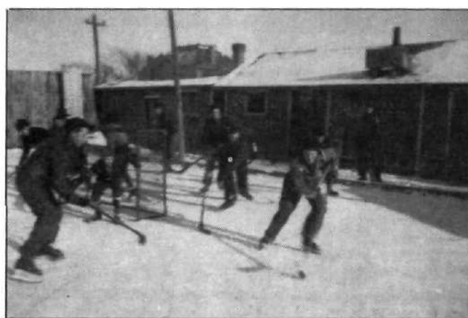
Hockey at East End Rink, 1934 and 1937