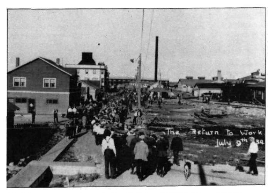
The 9 July return to work march. Note the helmeted RCMP officers.

On 14 July, the strike committee finally succumbed to the inevitable and voted 201 to 18 in favour of ending the strike. 116 In a last ditch effort to prevent discrimination against union members, the committee addressed a telegram to the Department of Labour asking for government arbitration. Complaining that 107 men had been discriminated against, the local branch of the MWUC requested the establishment of a Board of Arbitration to investigate miners' claims. 117 The Deputy Minister of Labour replied that it was impossible to set up a Board of Arbitration because the Industrial Disputes Investigation Act clearly did not apply to men who were no longer in the employ of the company. 118 With its leaders awaiting trial, its forces cut down by more than 75 per cent, the mine in operation, and the refusal of government arbitration, the local branch of the MWUC had its last hope rejected.